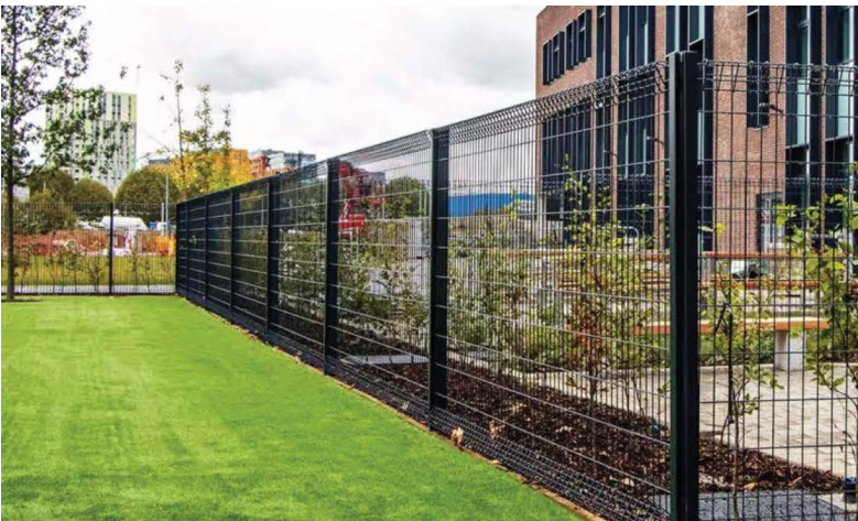
Example of metal mesh fencing