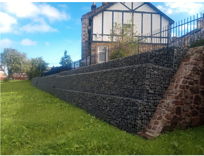
Example of gabion baskets with stone buttresses