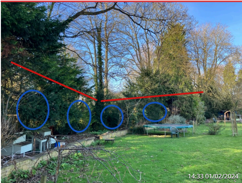
Photo shows mature ash trees in background, no works to be carried out on these trees.

Cut umderstorey yew and conifer (circled blue) to form hedge at approximately 2.5m (red line).