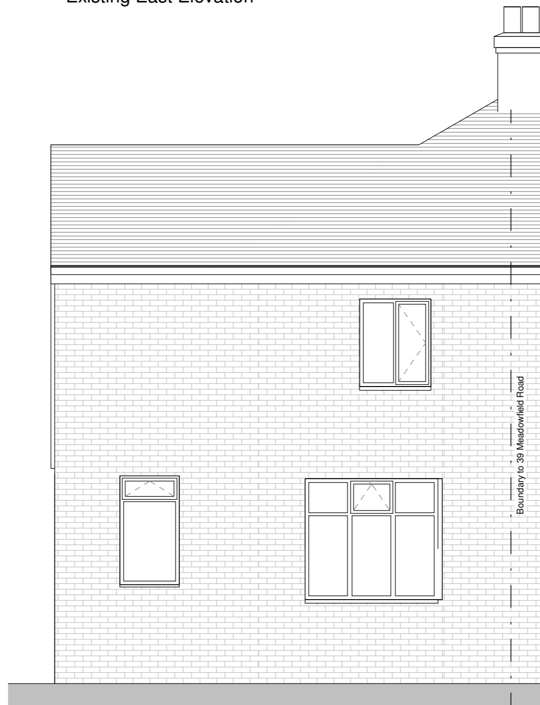
Existing West Elevation