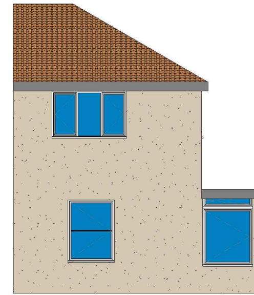
4 Existing Front_Elevation 1 : 100