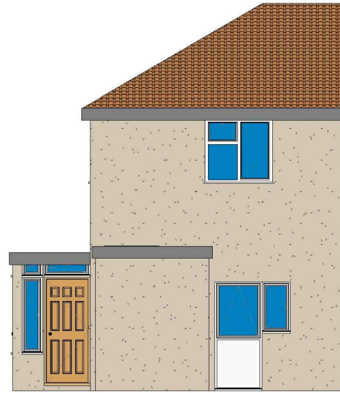
1 Existing Rear_Elevation 1 : 100