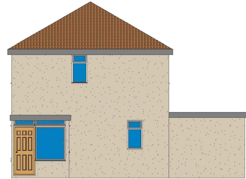
2 Existing Side 02_Elevation 1 : 100