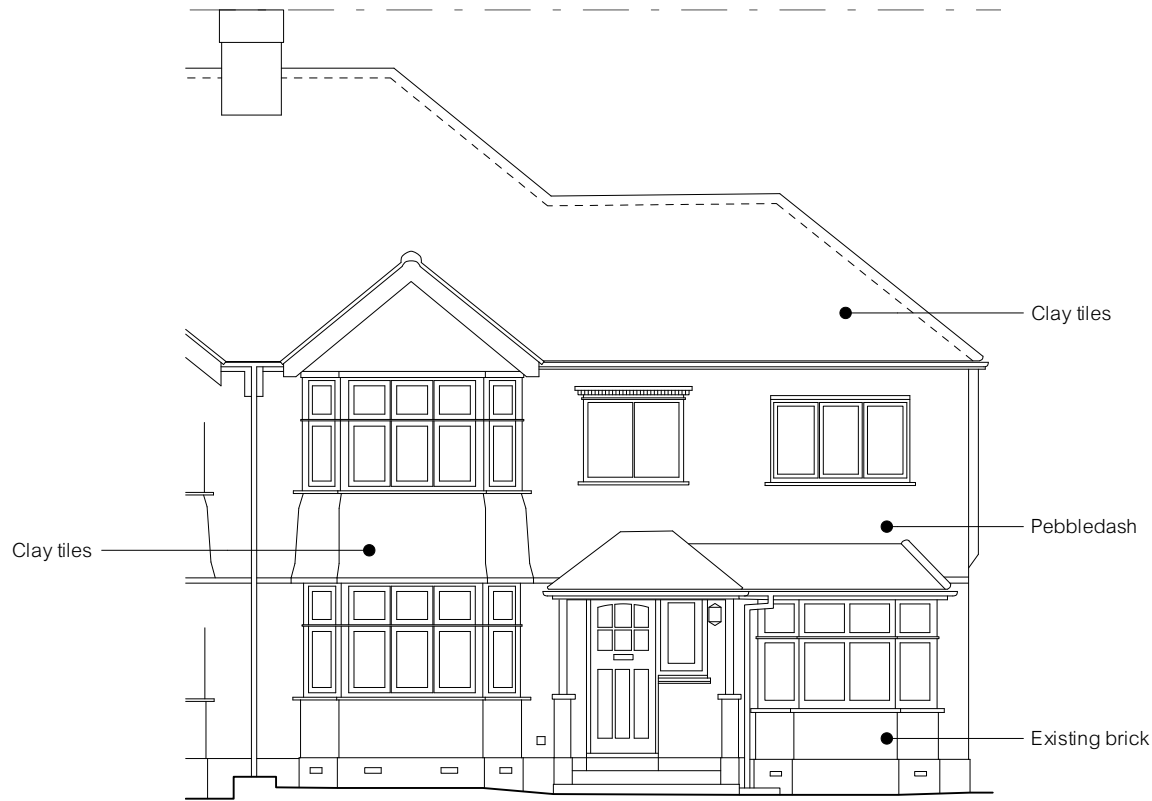
01. EXISTING FRONT ELEVATION 1:100