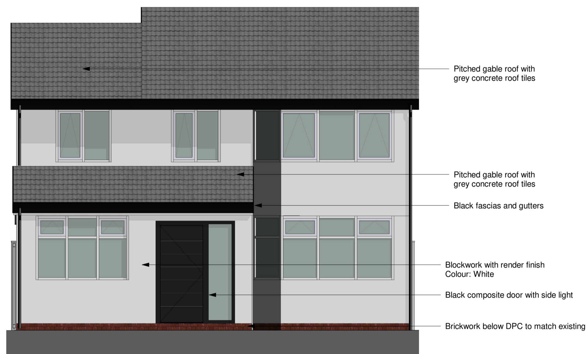
1 Front Elevation - Proposed

This drawing is copyright and to be returned to the architect on completion of the contract.