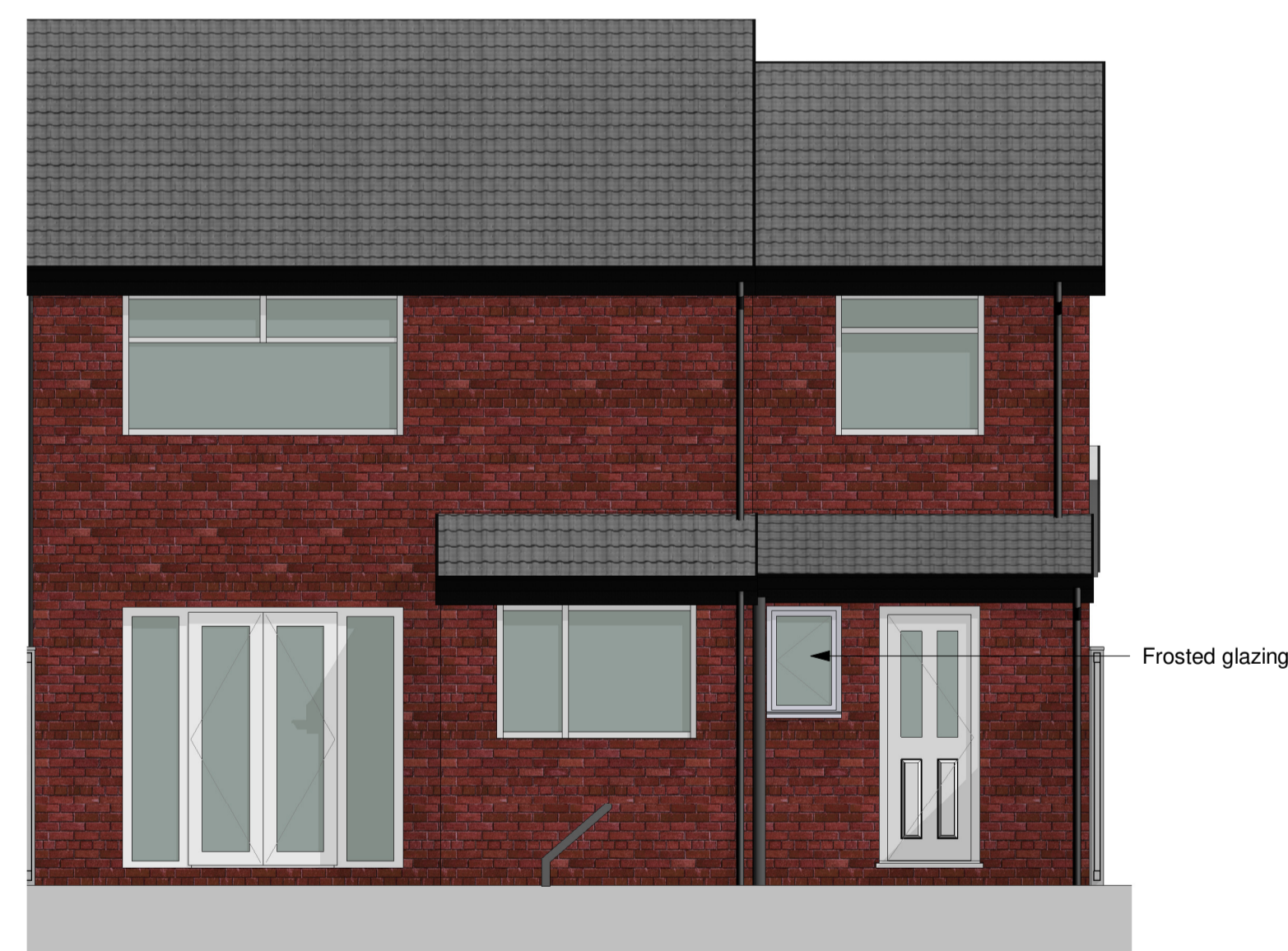
2 Rear Elevation - Proposed