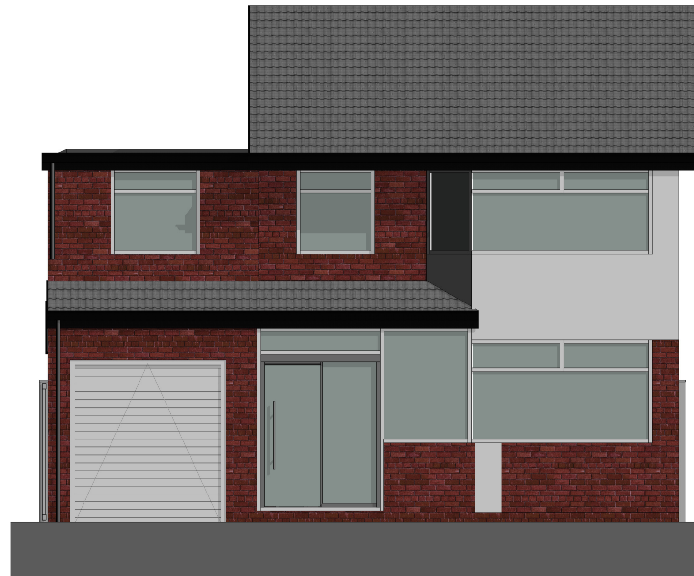
1 Front Elevation - Existing