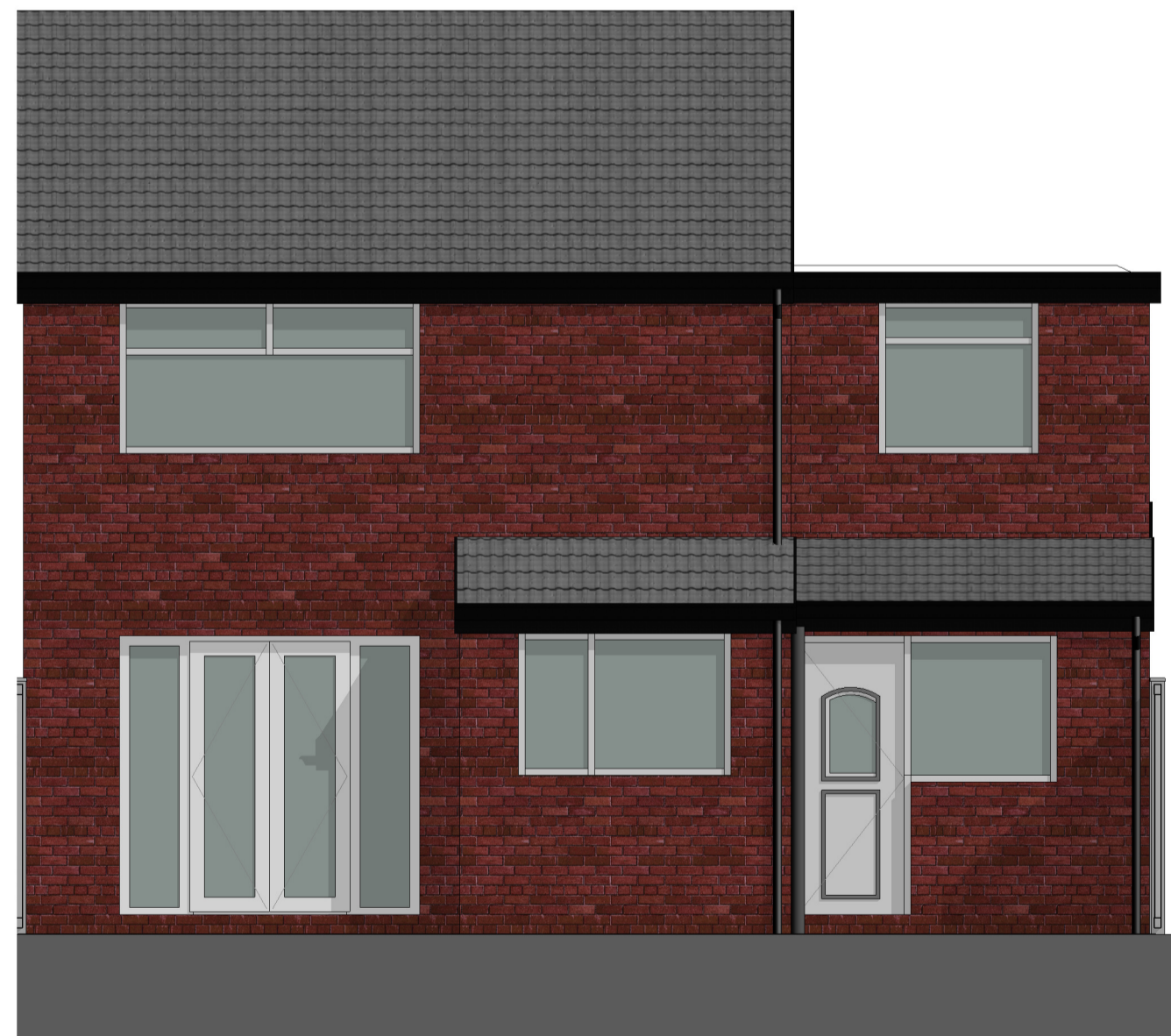
2 Rear Elevation - Existing