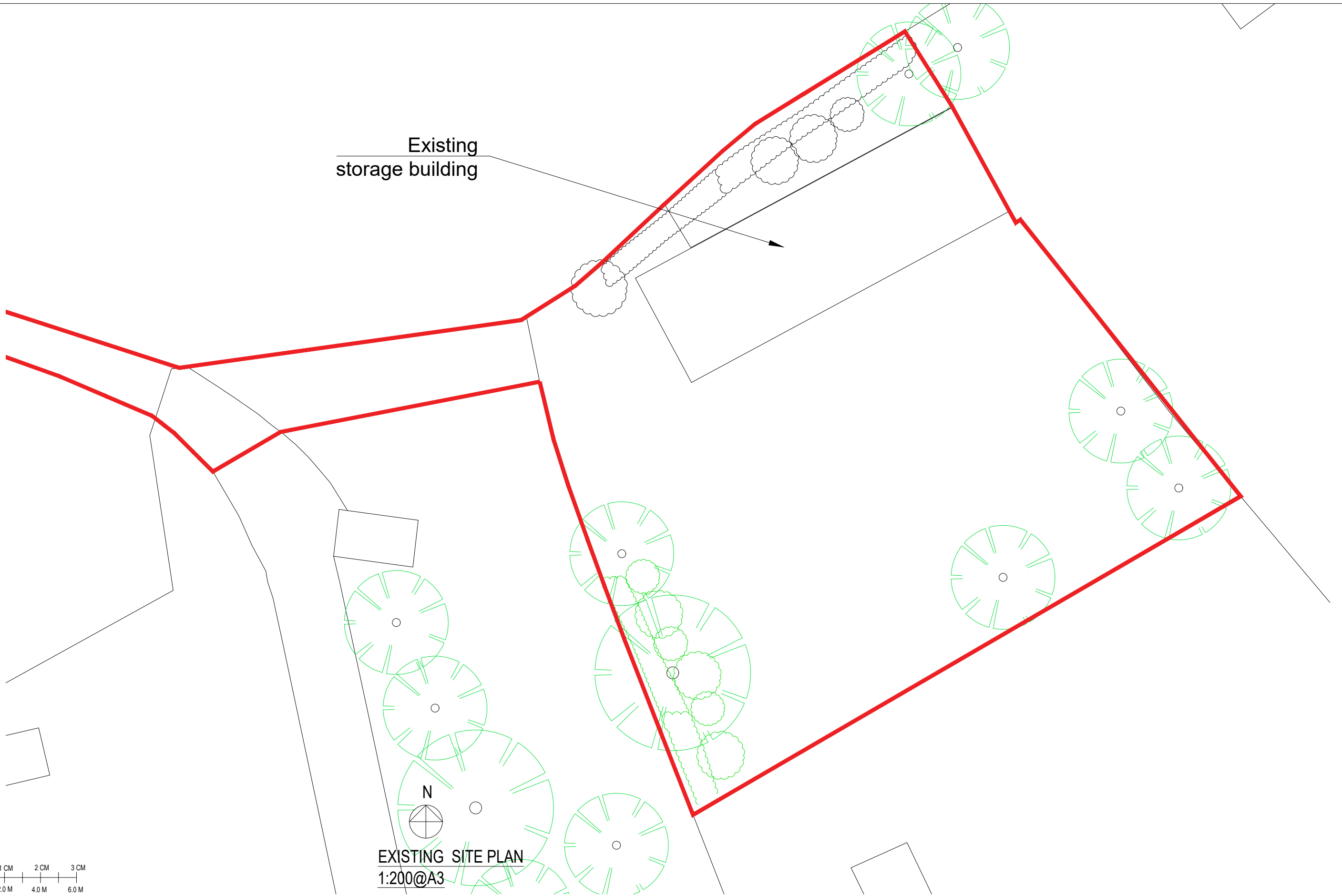
EXISTING SITE PLAN 1:200@A3