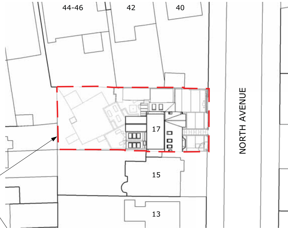
2 - SITE PLAN 1:500