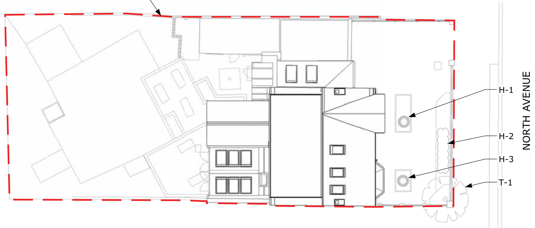
3 - BLOCK PLAN 1:200