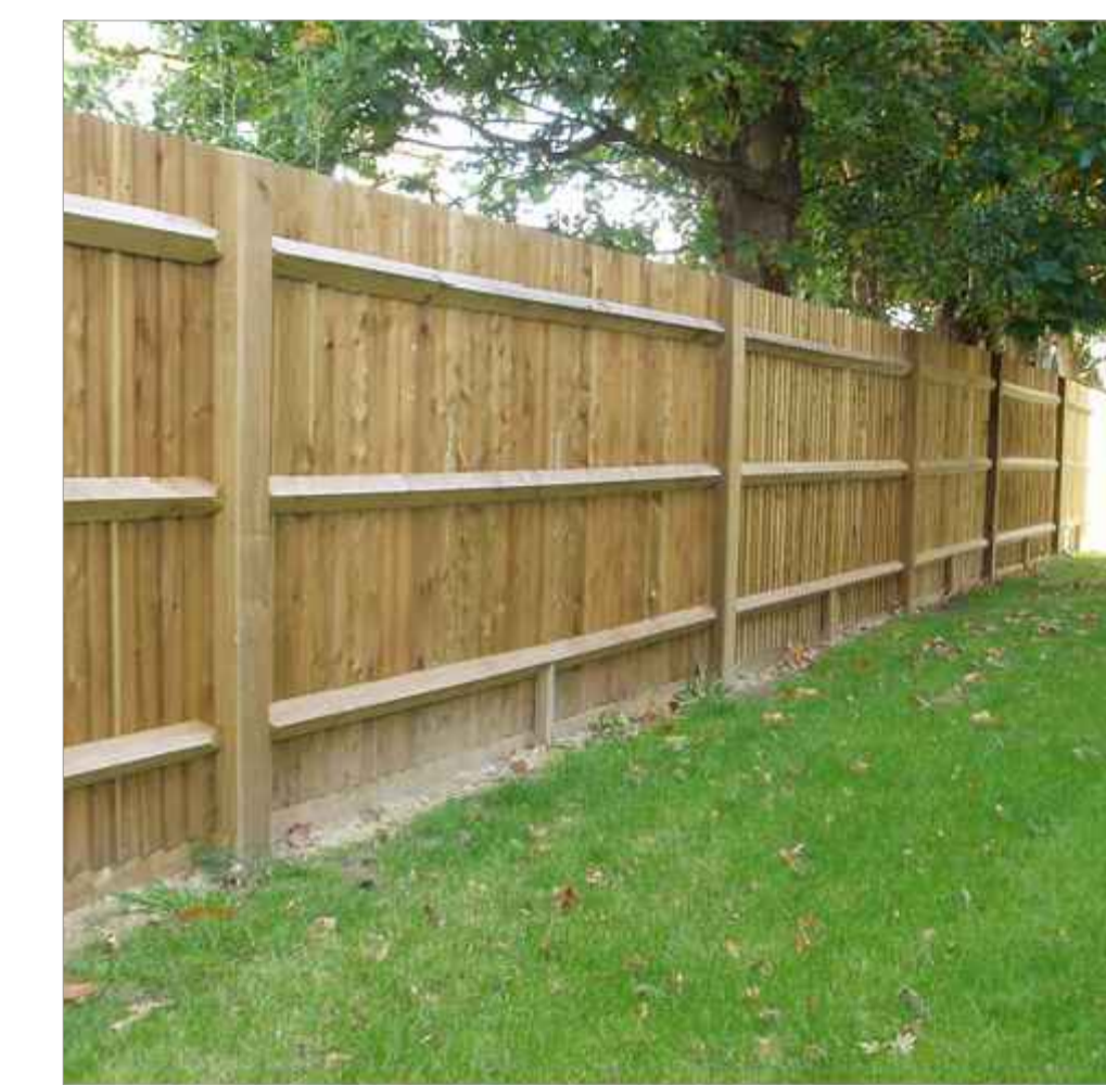
1800mm high timber close board fence with timber posts for inter-garden boundaries