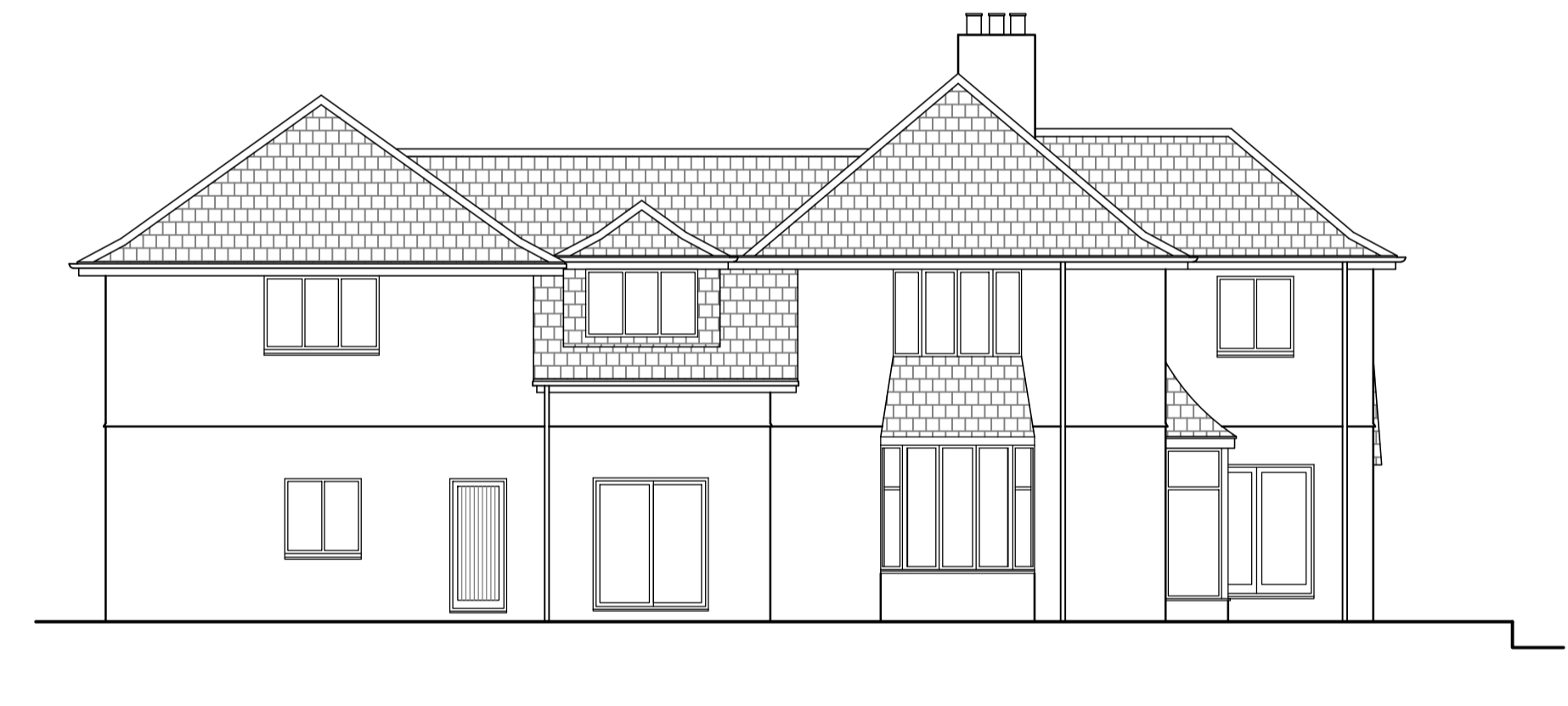
EXISTING NORTH-WEST (SIDE) ELEVATION

Do not scale for construction purposes. This drawing is copyright © 2024 and may not be altered, traced, copied, photographed or used for any purpose other than that for which it is issued without the written permission of Pollard Architectural Ltd. The Contractor is to check all dimensions, levels and angles on site prior to commencement of works. Any discrepancy or query to be reported and clarified before associated work proceeds. NB. No works shall commence without Planning and/or Building Regulations Approvals firmly in place.