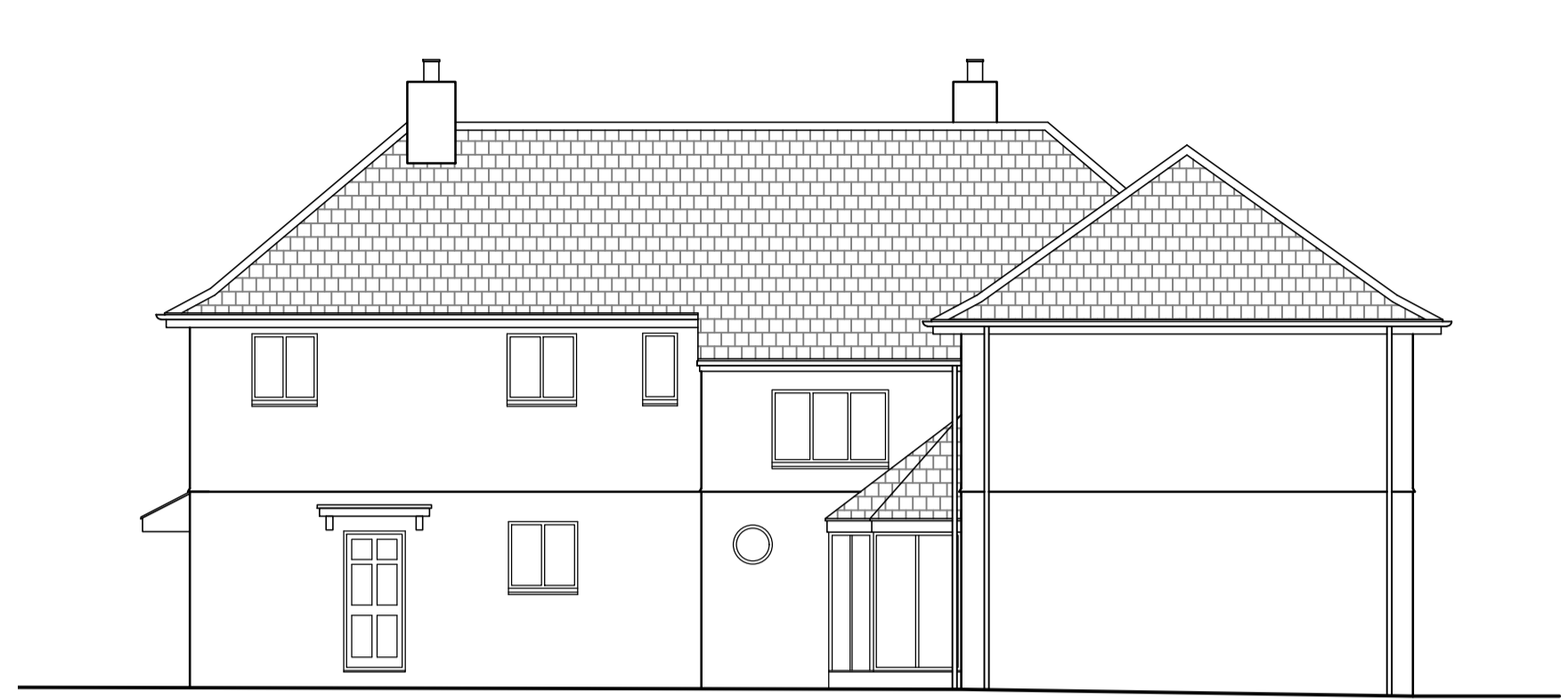
EXISTING NORTH-EAST (FRONT) ELEVATION