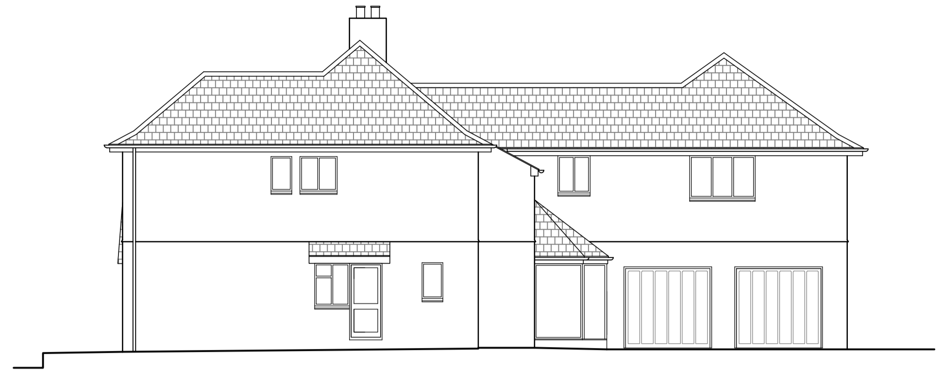
EXISTING SOUTH-EAST (SIDE) ELEVATION