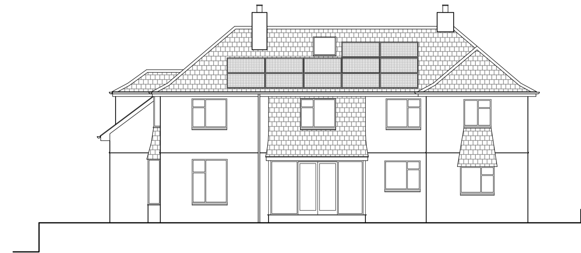
EXISTING SOUTH-WEST (REAR) ELEVATION