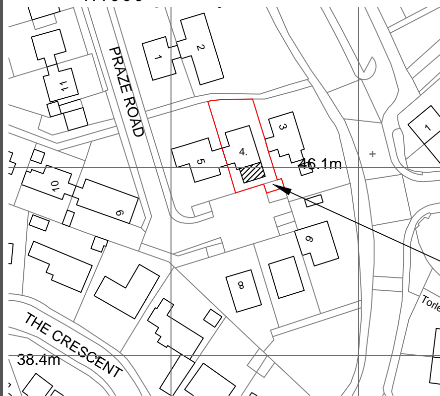
Proposed Site Location Plan 1:1000