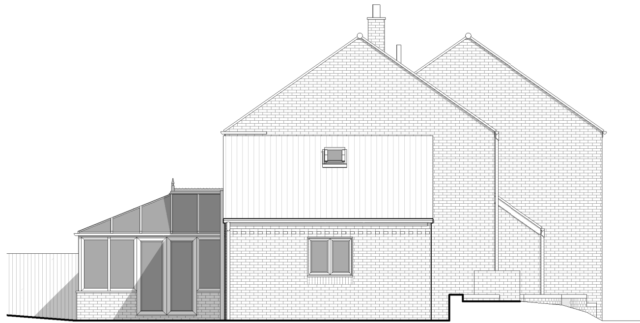
2 EXISTING WEST ELEVATION 1:100