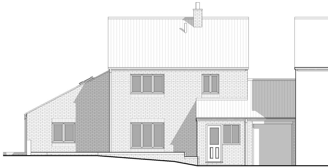
1 EXISTING SOUTH ELEVATION 1:100