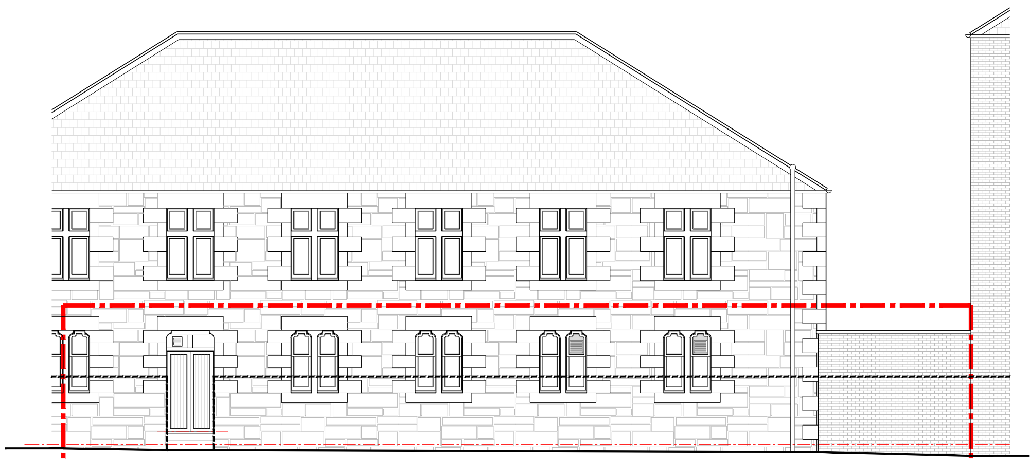
Existing West Elevation Scale 1:100

All dimensions and levels to be checked on site prior to the commencement of work. Architect to be informed of any discrepancies prior to the commencement of work. Unspecified dimensions are not to be scaled off this drawing for construction purposes. All dimensions are in millimetres unless stated otherwise. If any dimensions or details conflict please notify the Architect immediately. This drawing is to be used for STATUTORY purposes only. This is not a CONSTRUCTION drawing.