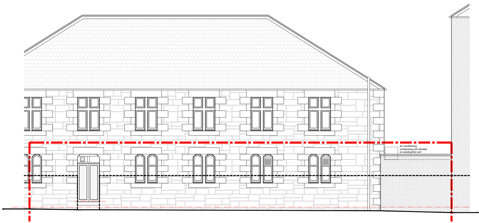
Proposed West Elevation Scale 1:100