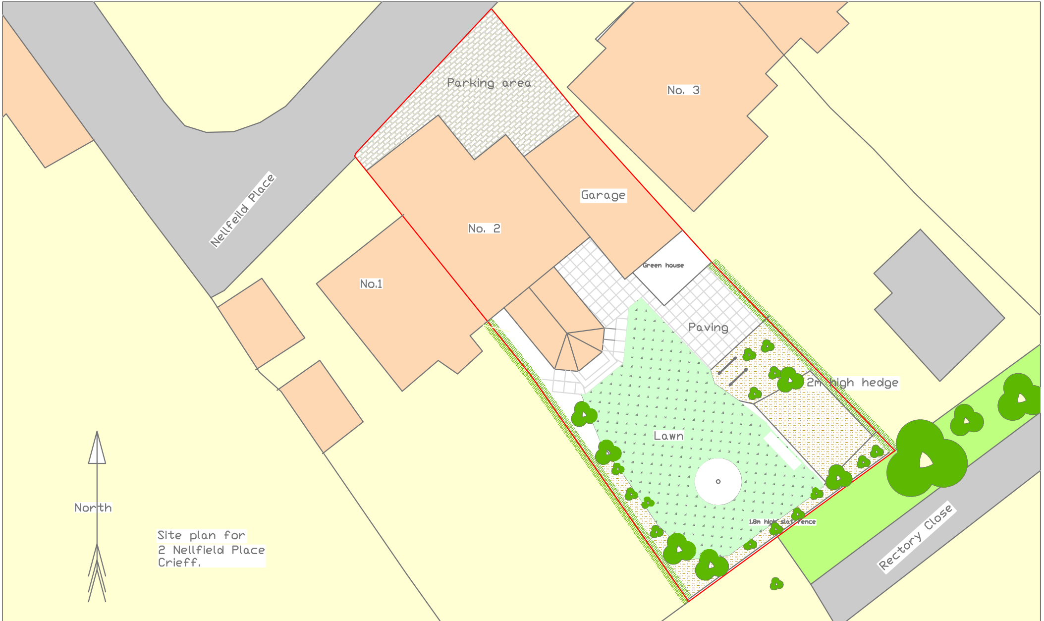
Site plan for 2 Nellfield Place Crieff.