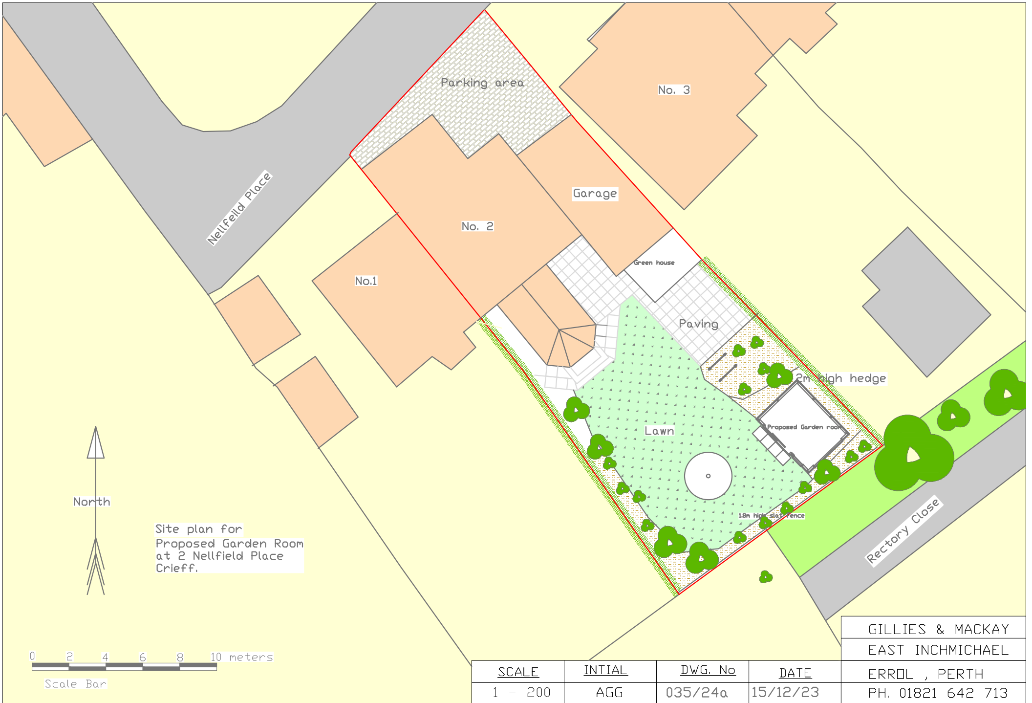
Site plan for Proposed Garden Room at 2 Nellfield Place Crieff.