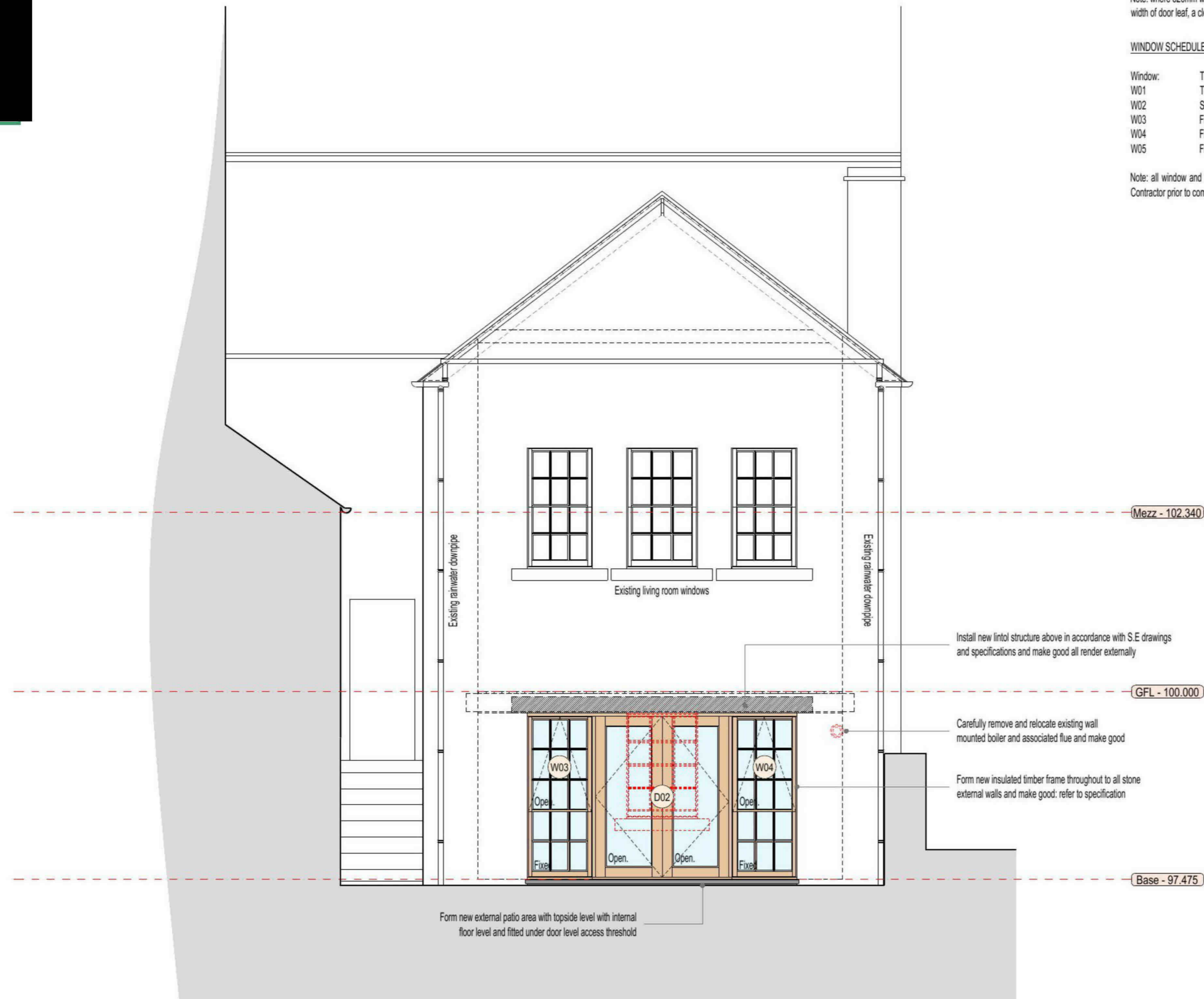
SOUTH ELEVATION 1:50 @ A2

Note: all window and fixed glazing sizes are indicative and for the purposes of Building Warrant only. All window sizes to be verified on site by Main Contractor prior to commencement of any order. Any discrepancies to be reported prior to commencement of works.