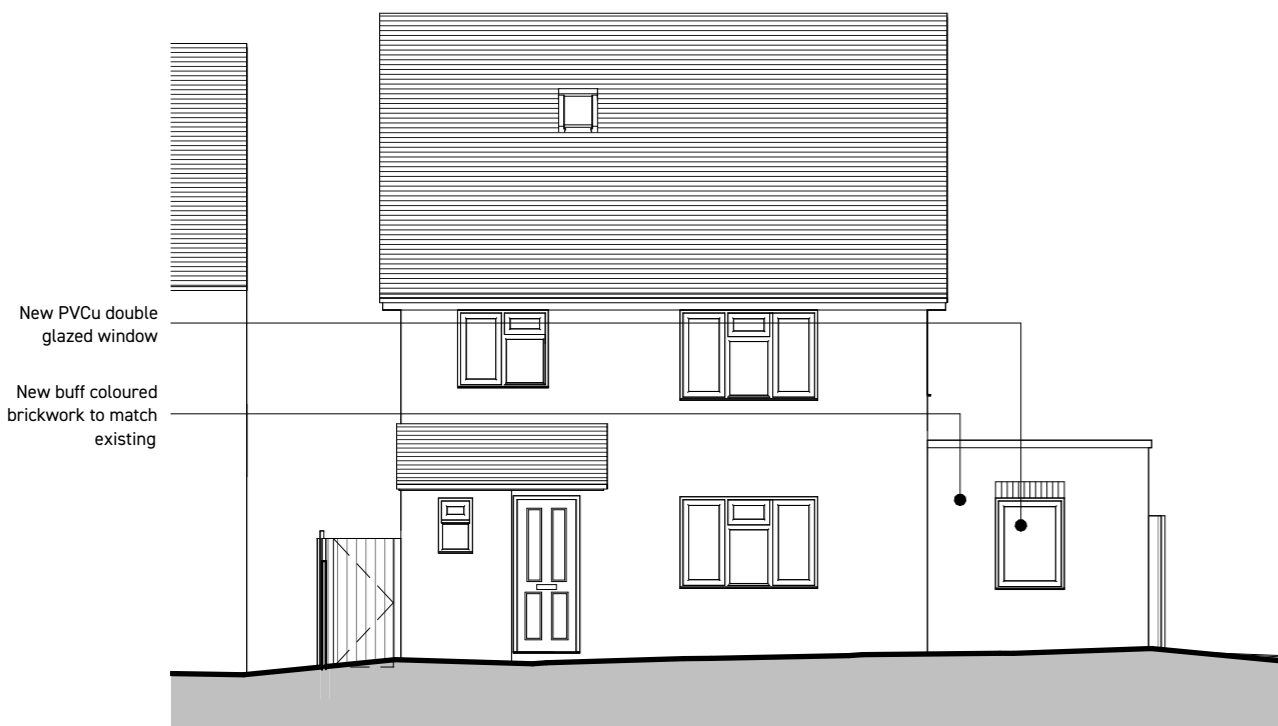
1 proposed north elevation 1:100