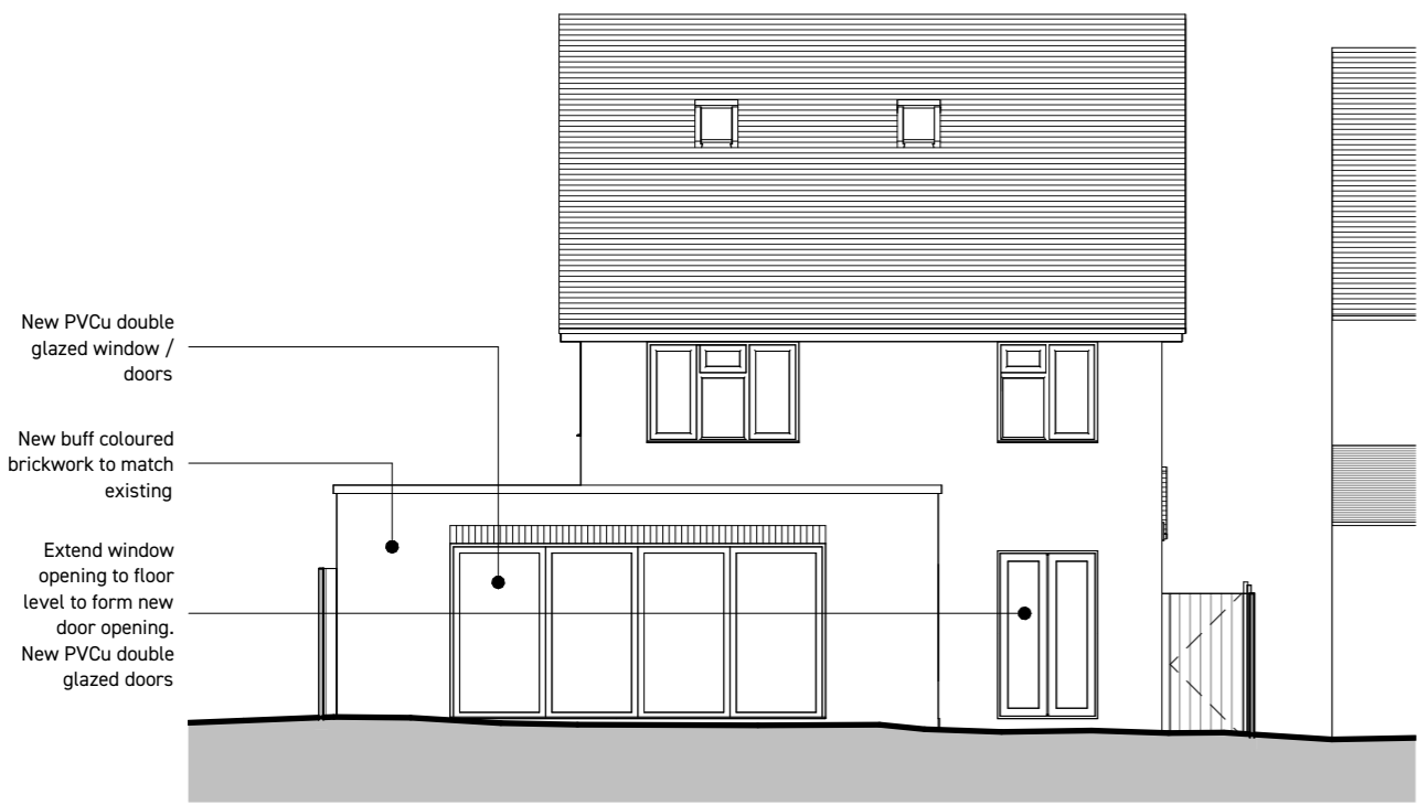
1 proposed south elevation 1:100