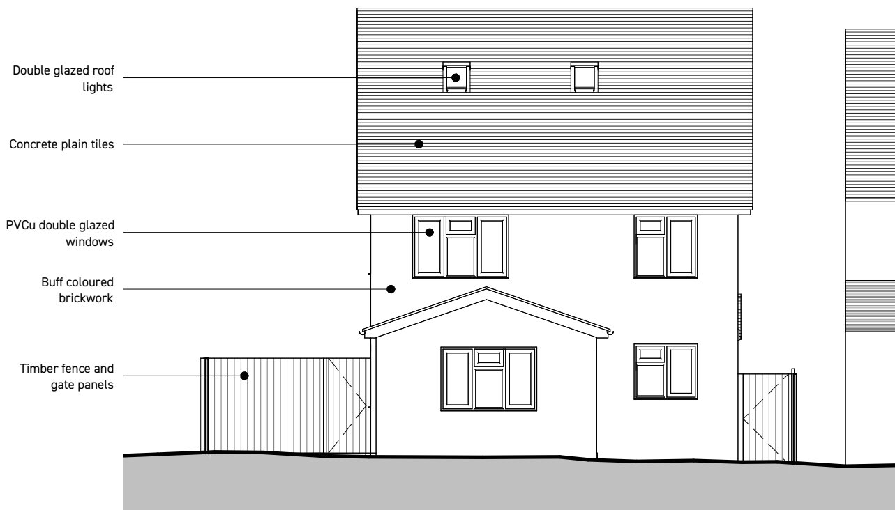
1 existing south elevation 1:100