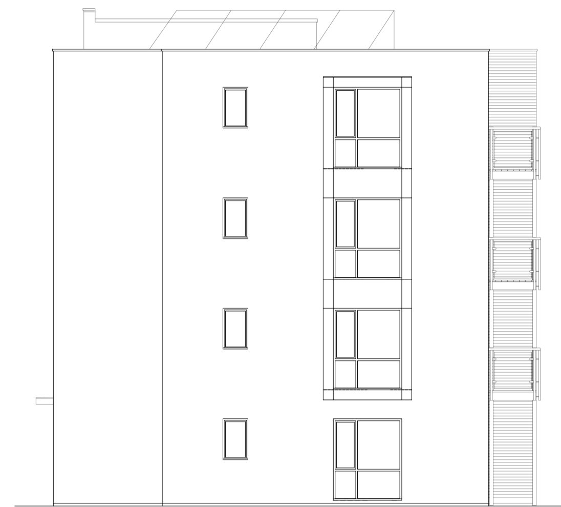
FRONT ELEVATION (facing Park Road)