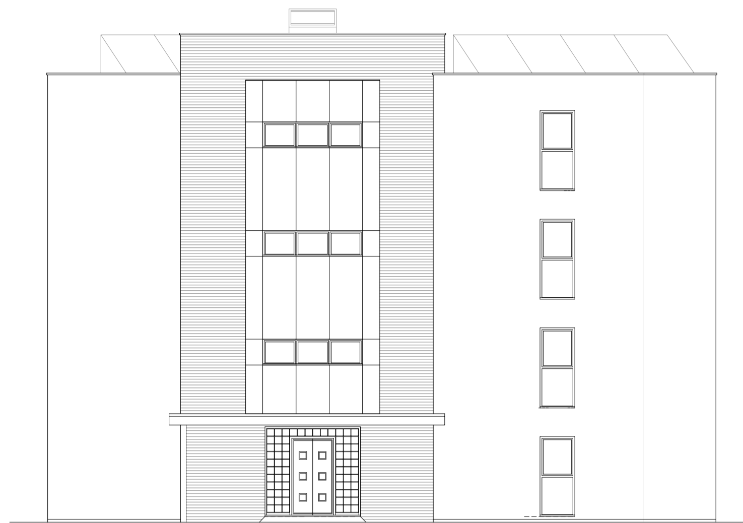
SIDE ELEVATION (facing Snowberry Close)