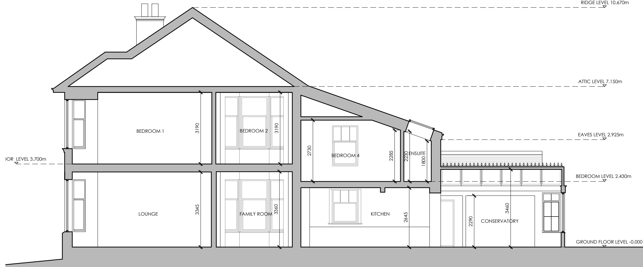
SECTION A-A AS EXISTING