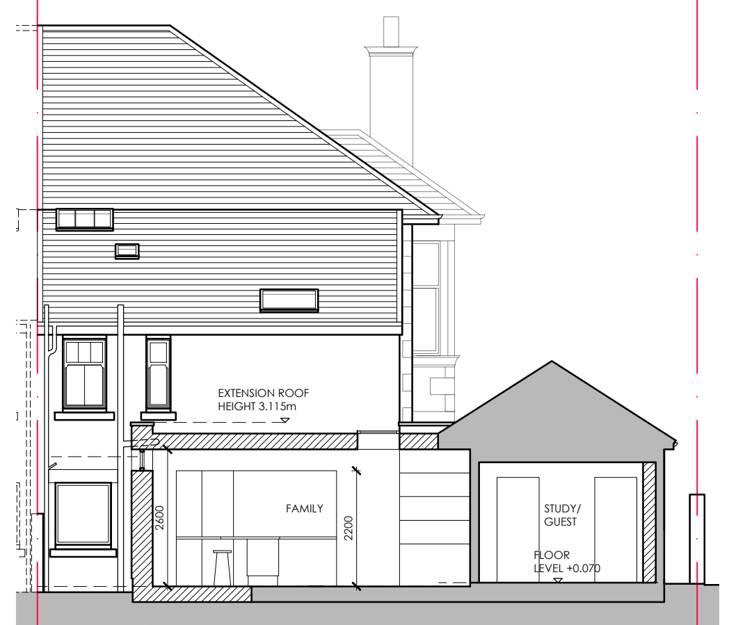
SECTION C-C AS PROPOSED