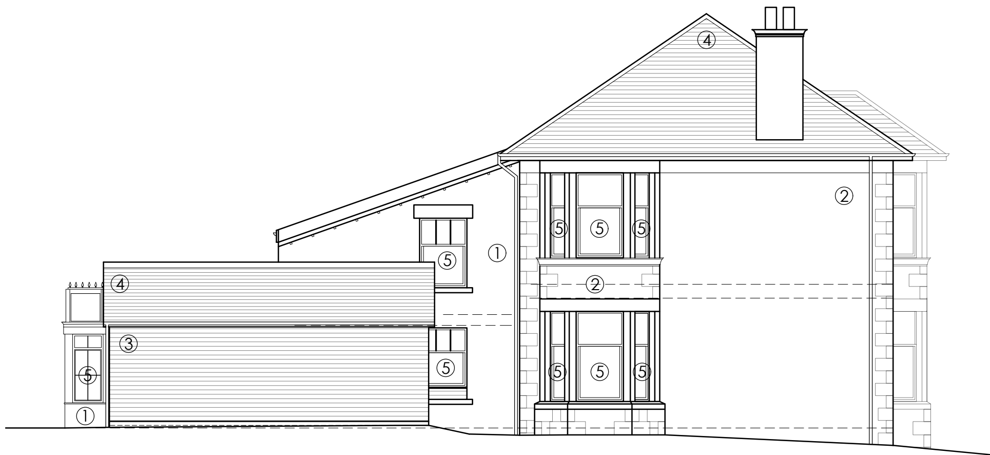
SIDE ELEVATION AS EXISTING