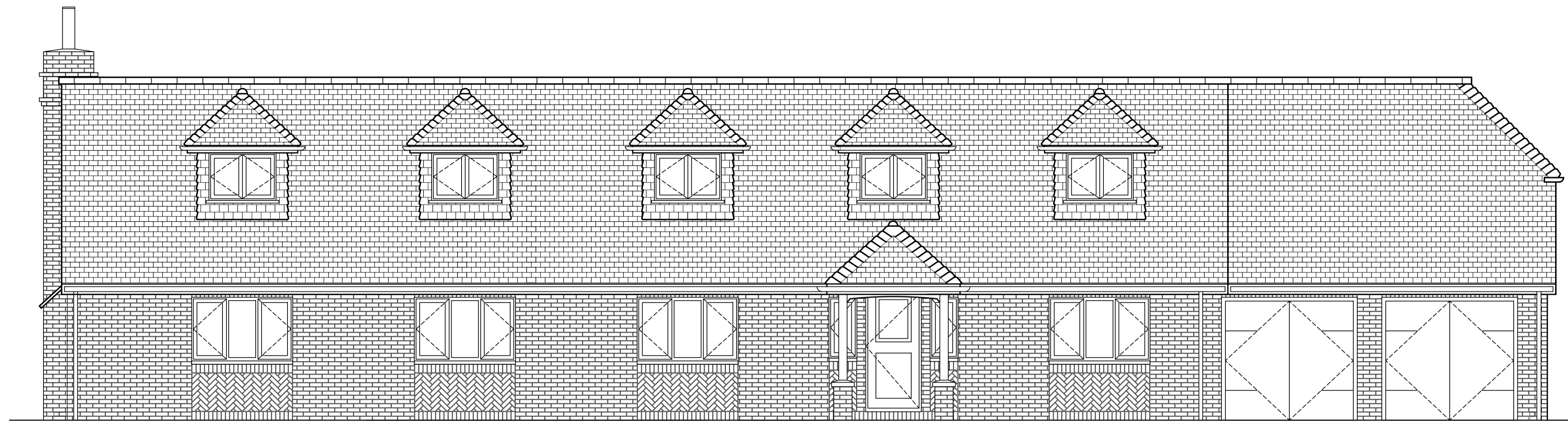
FRONT ELEVATION (SOUTH FACING)