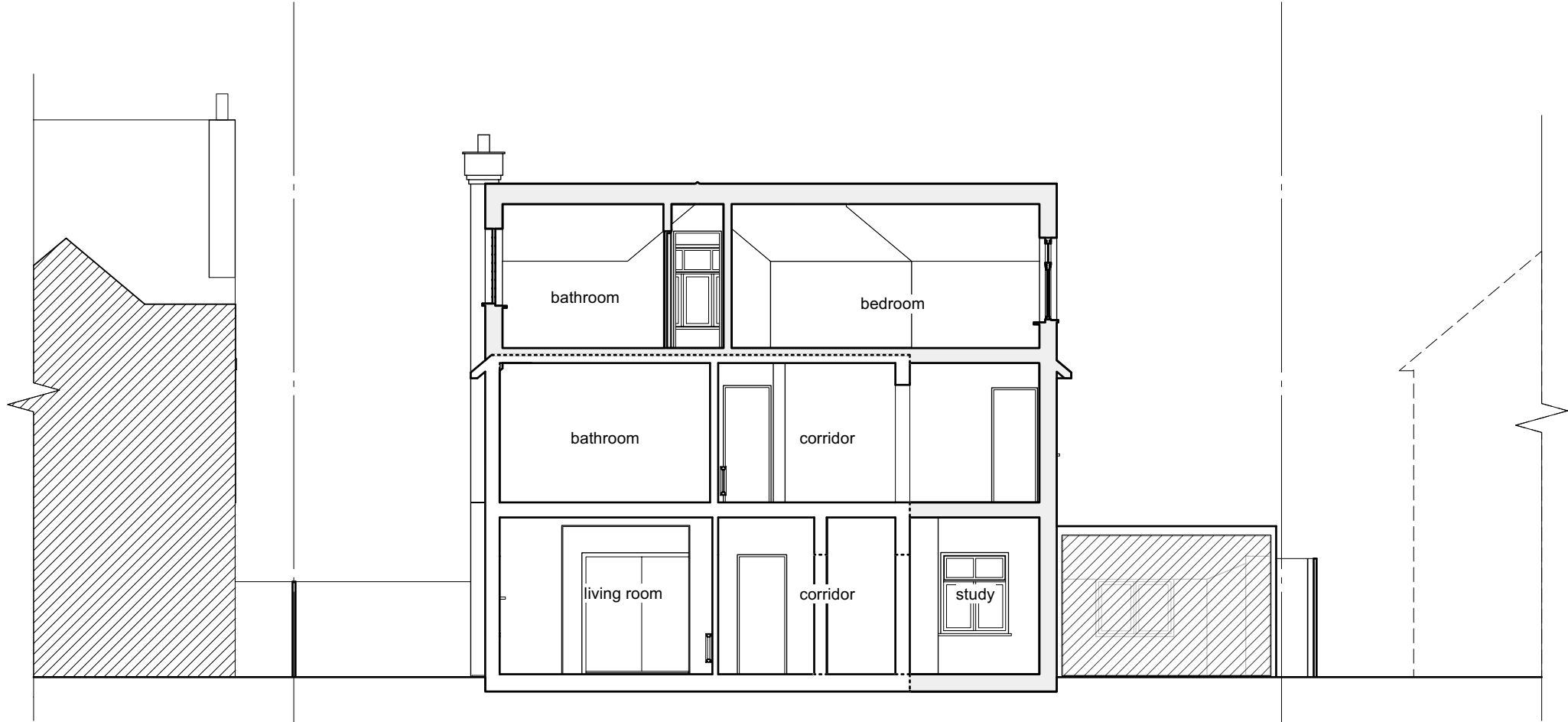
PROPOSED SECTION A - A

Notes: This drawing is the copyright of Spheron Architects (Ltd) and may not be used without their consent. The contractor is responsible for checking all dimensions before work starts. Any discrepancies to be brought to the attention of the Architect immediately.