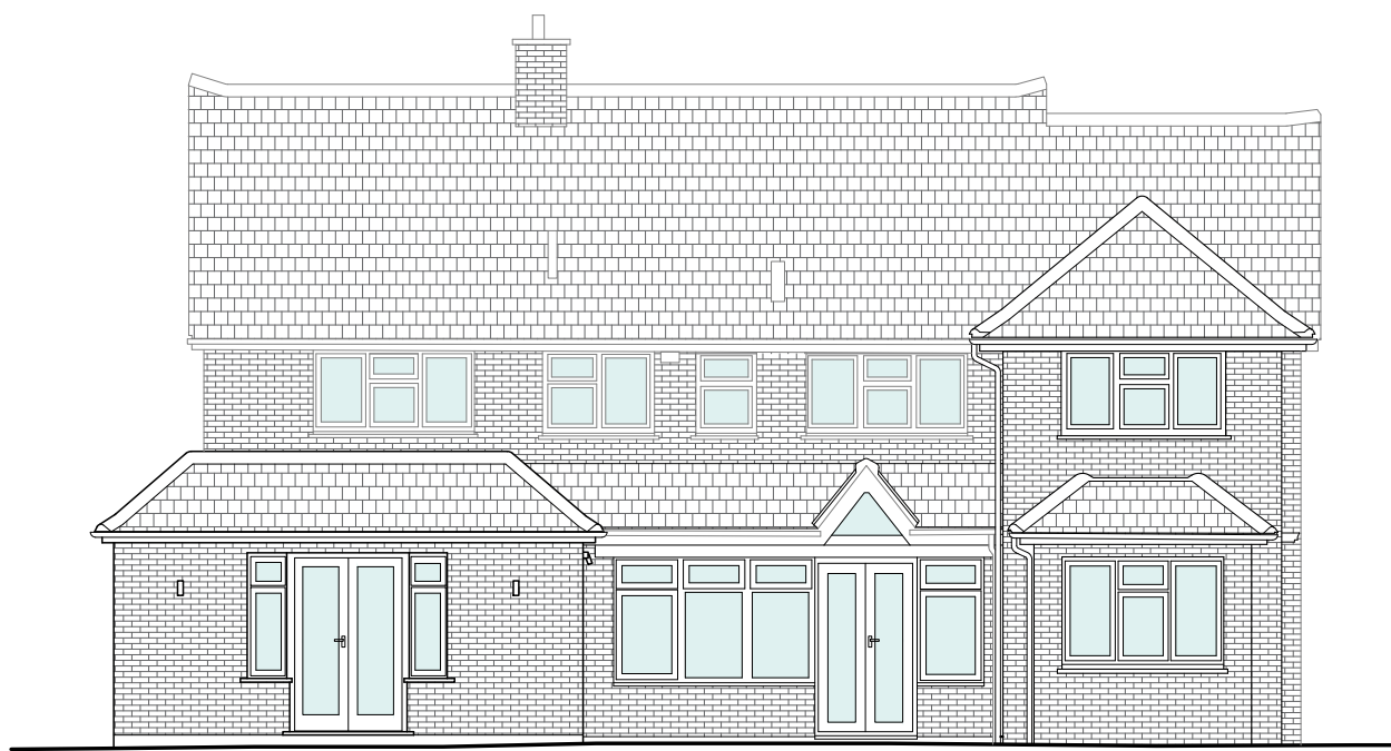
0 Existing Rear Elevation Scale 1:100 @ A3