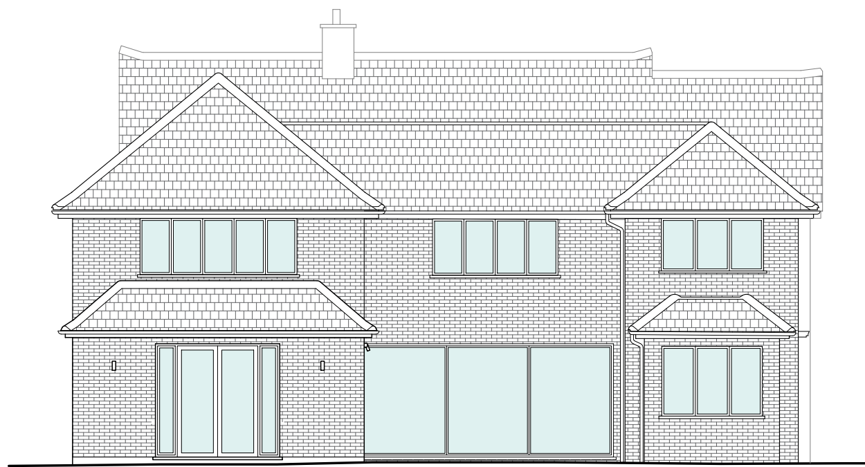
02 Proposed Rear Elevation Scale 1:100 @ A3

© This drawing and the building works depicted are the copyright of Studio Reach Limited. This drawing (or any part of it) may not be reproduced or amended, except without prior written permission by Studio Reach Limited. DO NOT SCALE THIS DRAWING - ALWAYS USE WRITTEN DIMENSIONS - ALL DIMENSIONS TO BE VERIFIED ON SITE