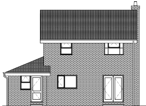
3 Existing Rear Elevation 1 : 100