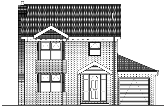
1 Existing Front Elevation 1 : 100