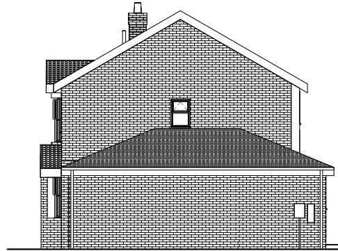
2 Existing Side Elevation 1 : 100