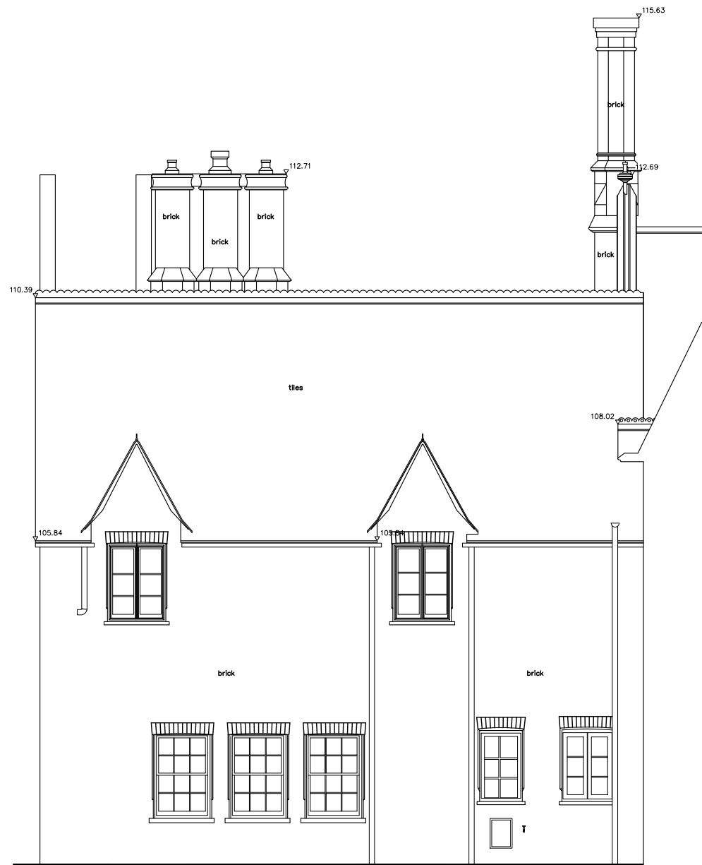
A north west elevation 031 1:100