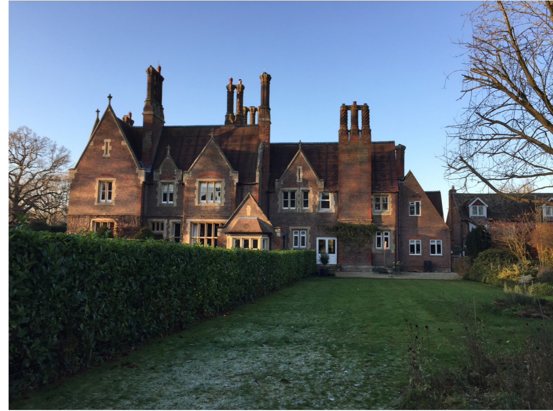
figure 3.1 rear elevation of Little Gaddesden House