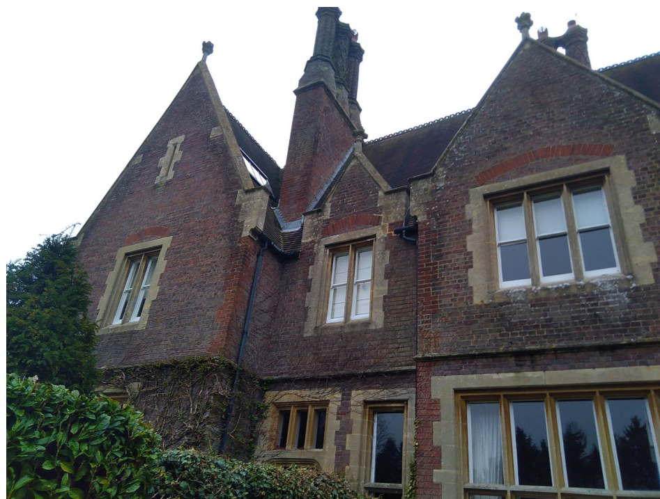
figure 2.2 roof of 4 Little Gaddesden House