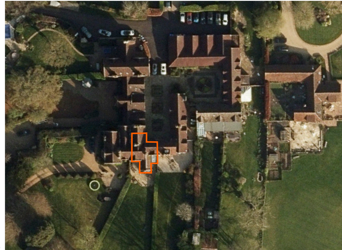
figure 2.1 aerial view of Little Gaddesden House

2.2 The roofs where the rooflights are proposed will not be visible from the road and two of the rooflights will not be visible at all as they face the valley in the roofscape