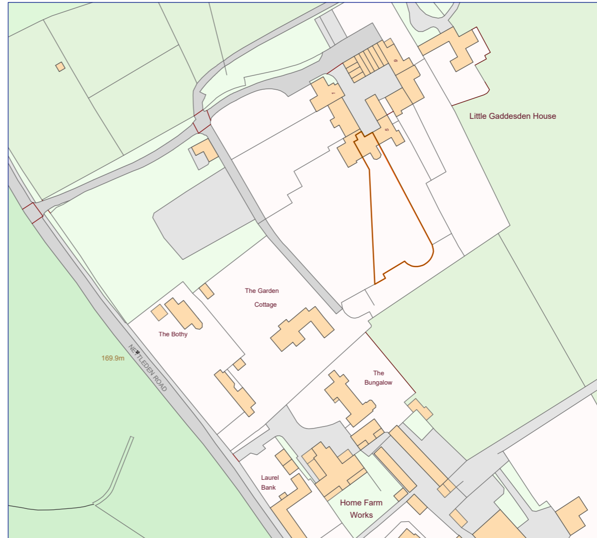
figure 1.1 Site Plan