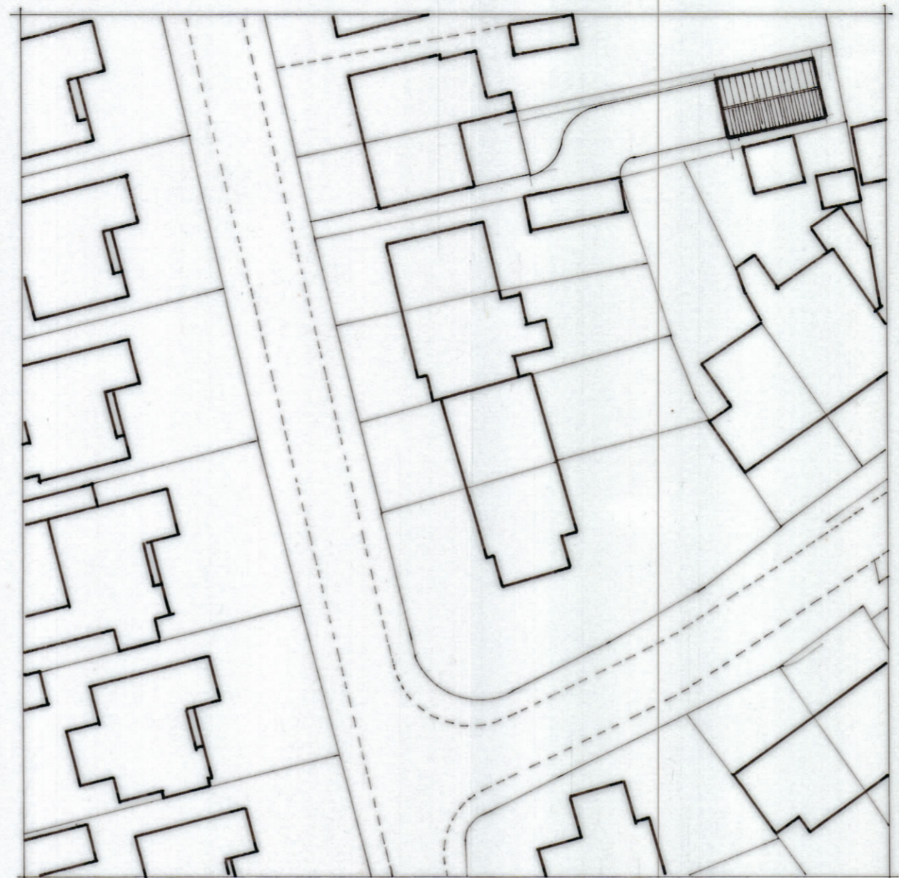
SITE LAYOUT PLAN 1:500