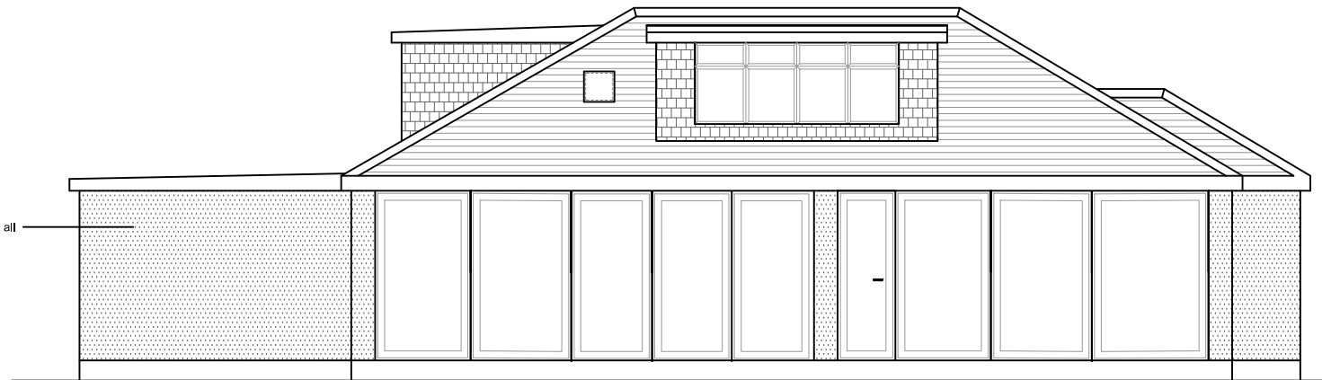
PROPOSED SIDE ELEVATION - 2