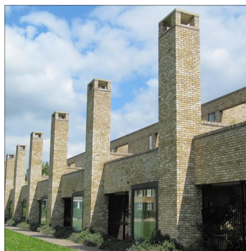
D Example Mystique blend used at Accordia