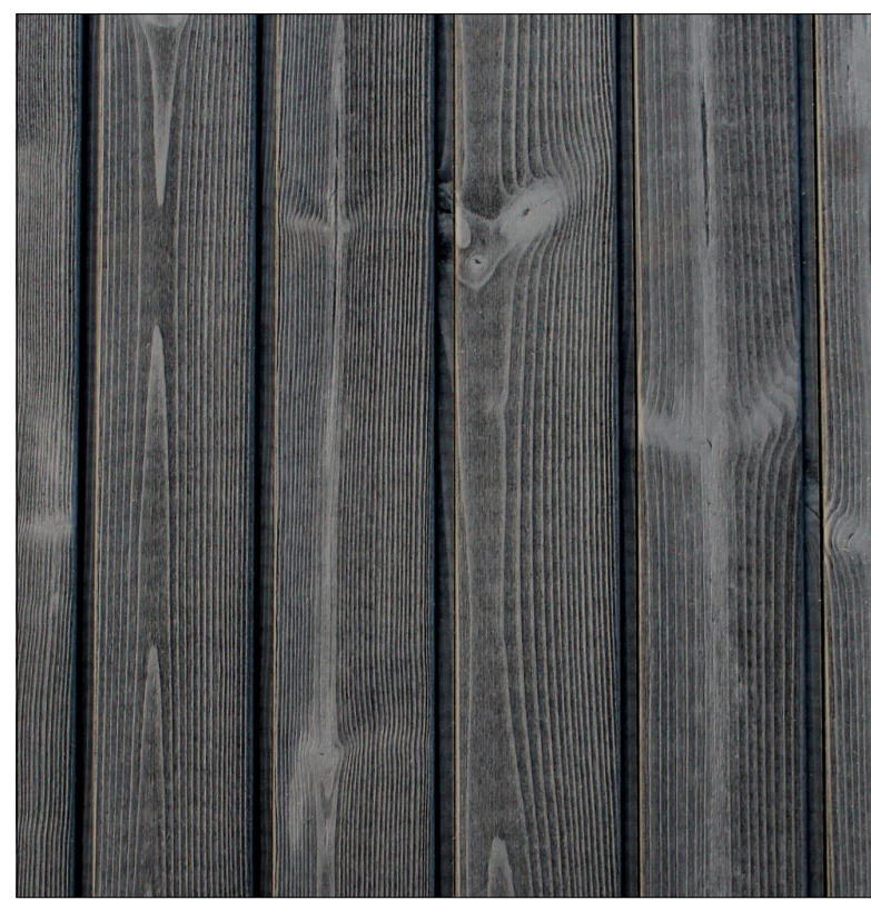
A Material Russwood Thermopine coated in black Woca oil https://www.russwood.co.uk/cedding/coating/woca-oil/