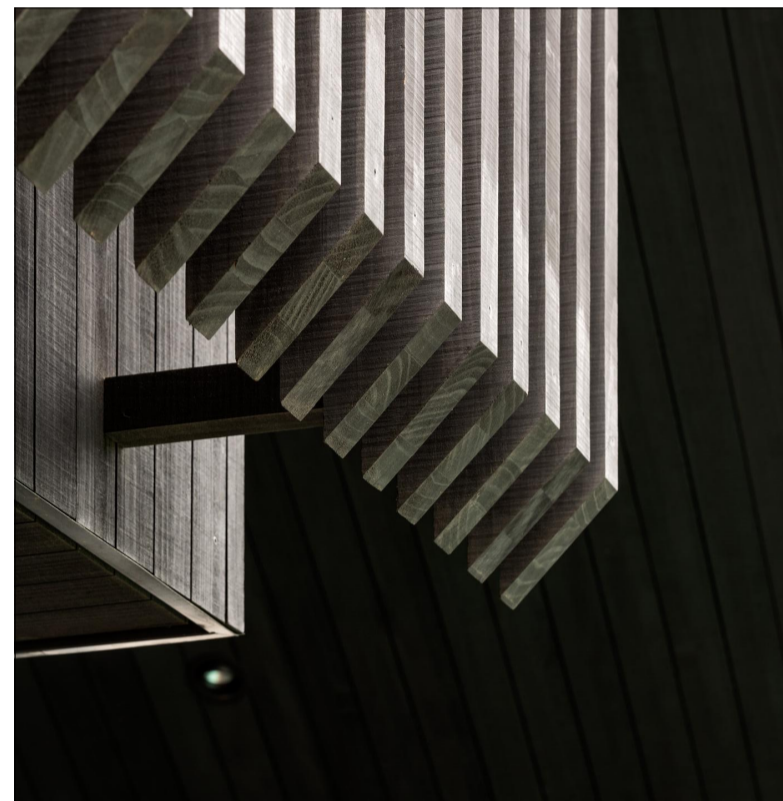
B Example Timber louvres fixed to stainless steel frame