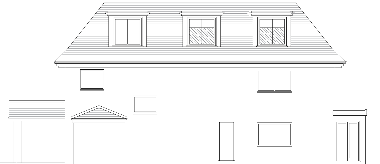
REAR ELEVATION-NORTH WEST