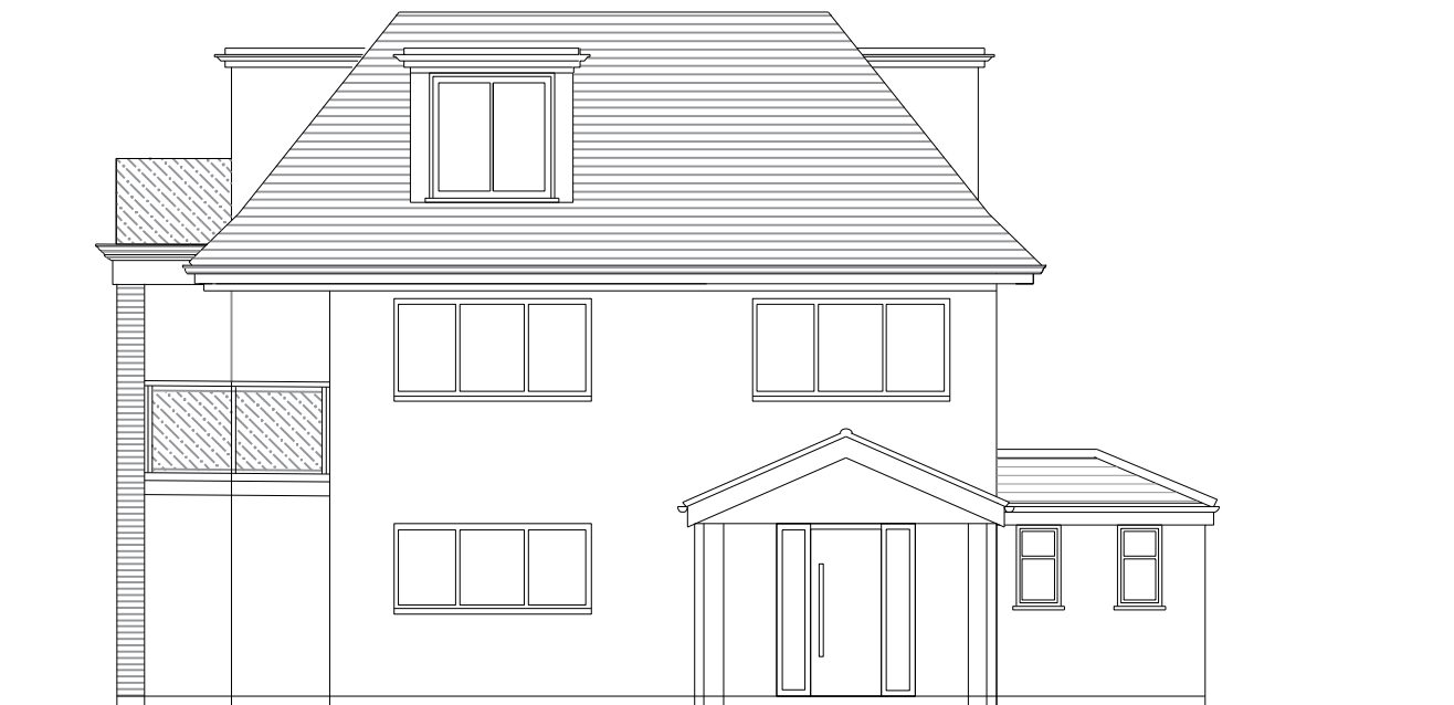
SIDE ELEVATION-NORTH EAST