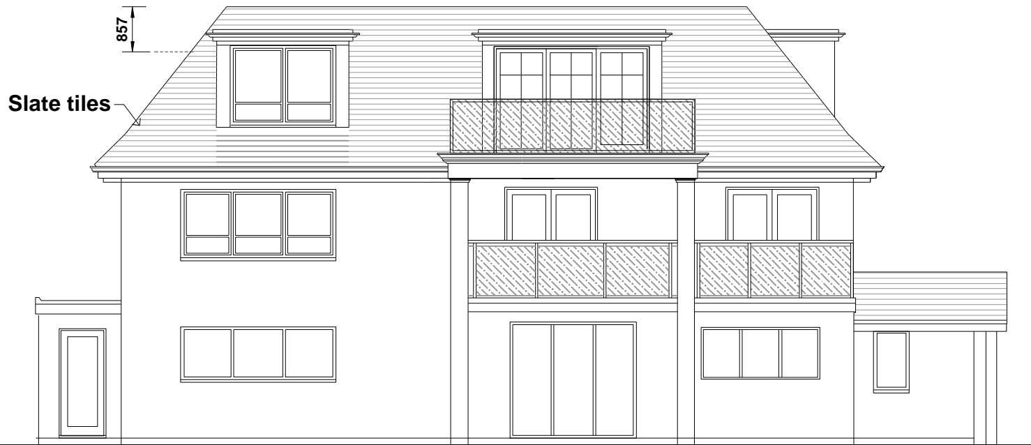
FRONT ELEVATION-SOUTH EAST