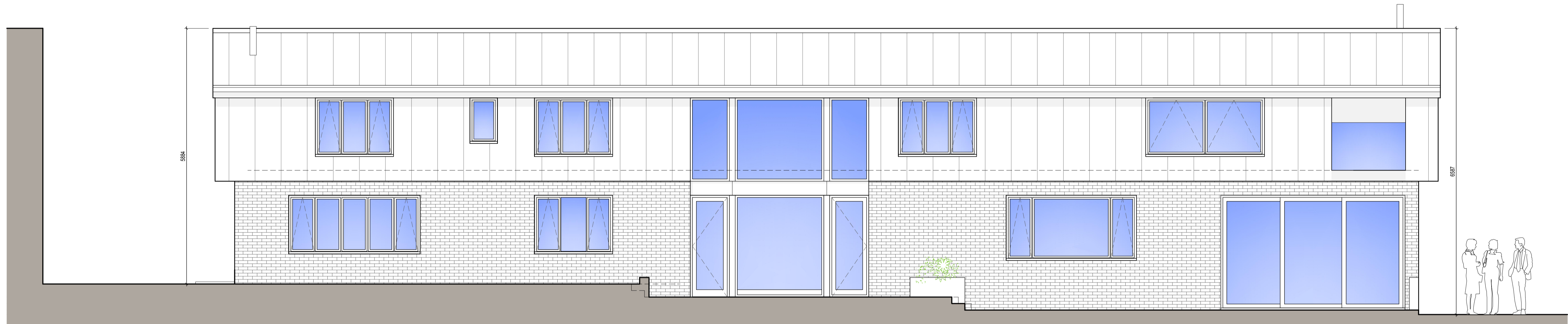
proposed southwest elevation 1:50