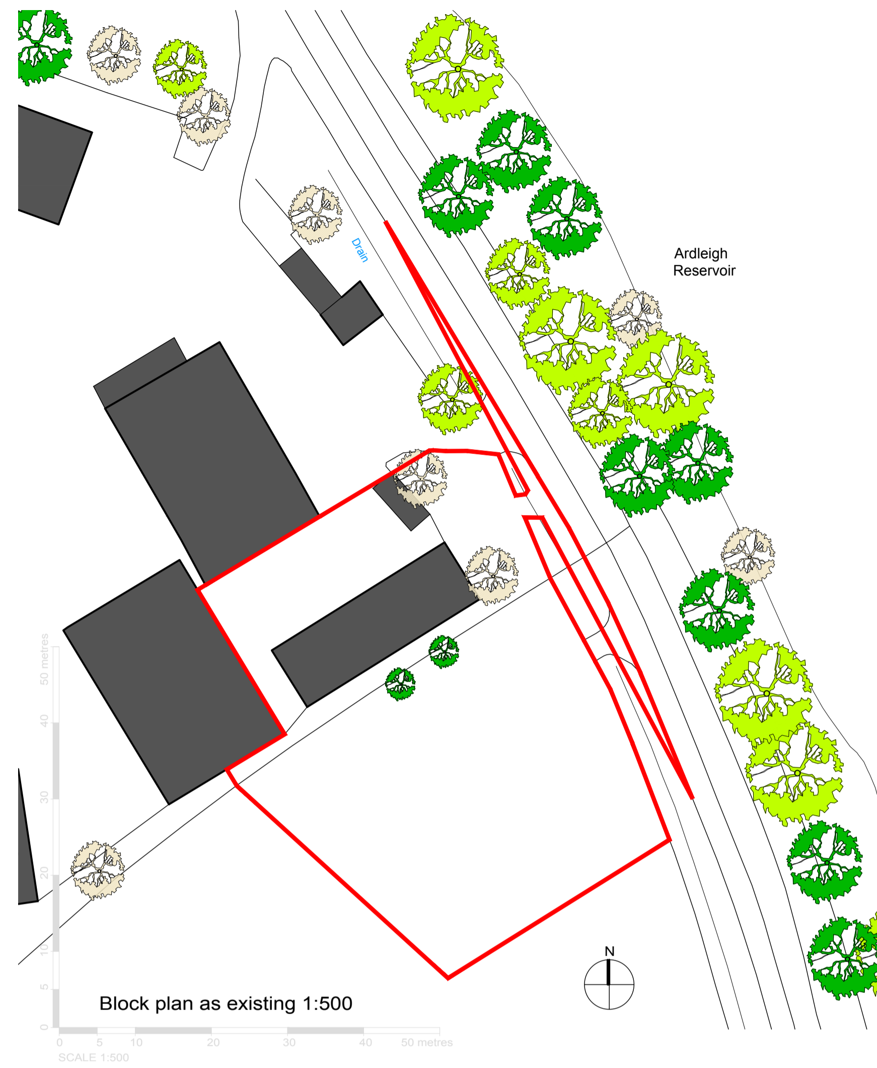
Block plan as existing 1:500