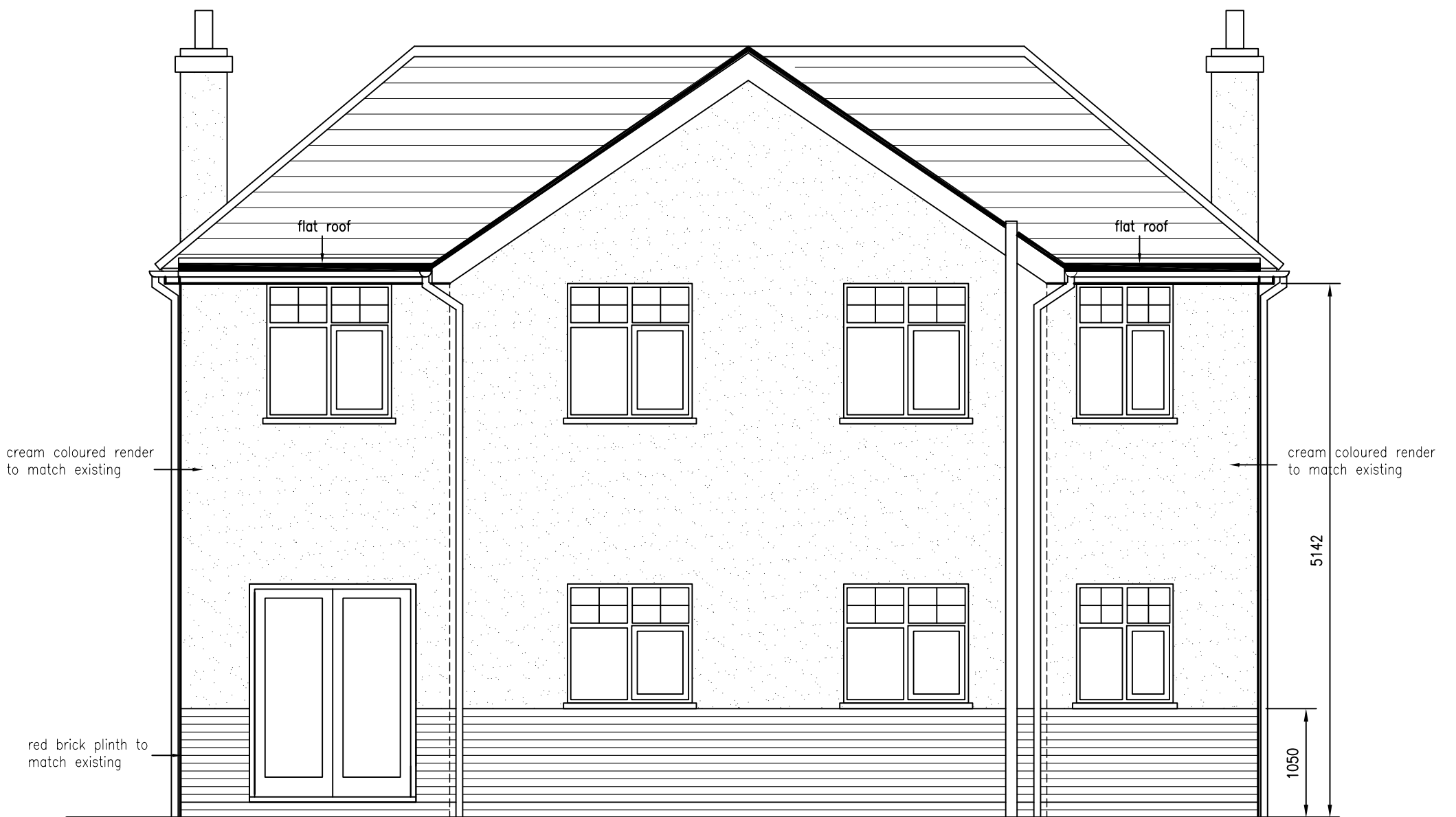
Proposed Rear Elevation scale 1 : 50