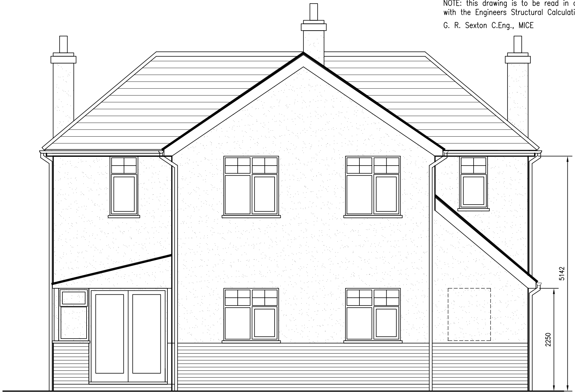
Existing Rear Elevation scale 1 : 50