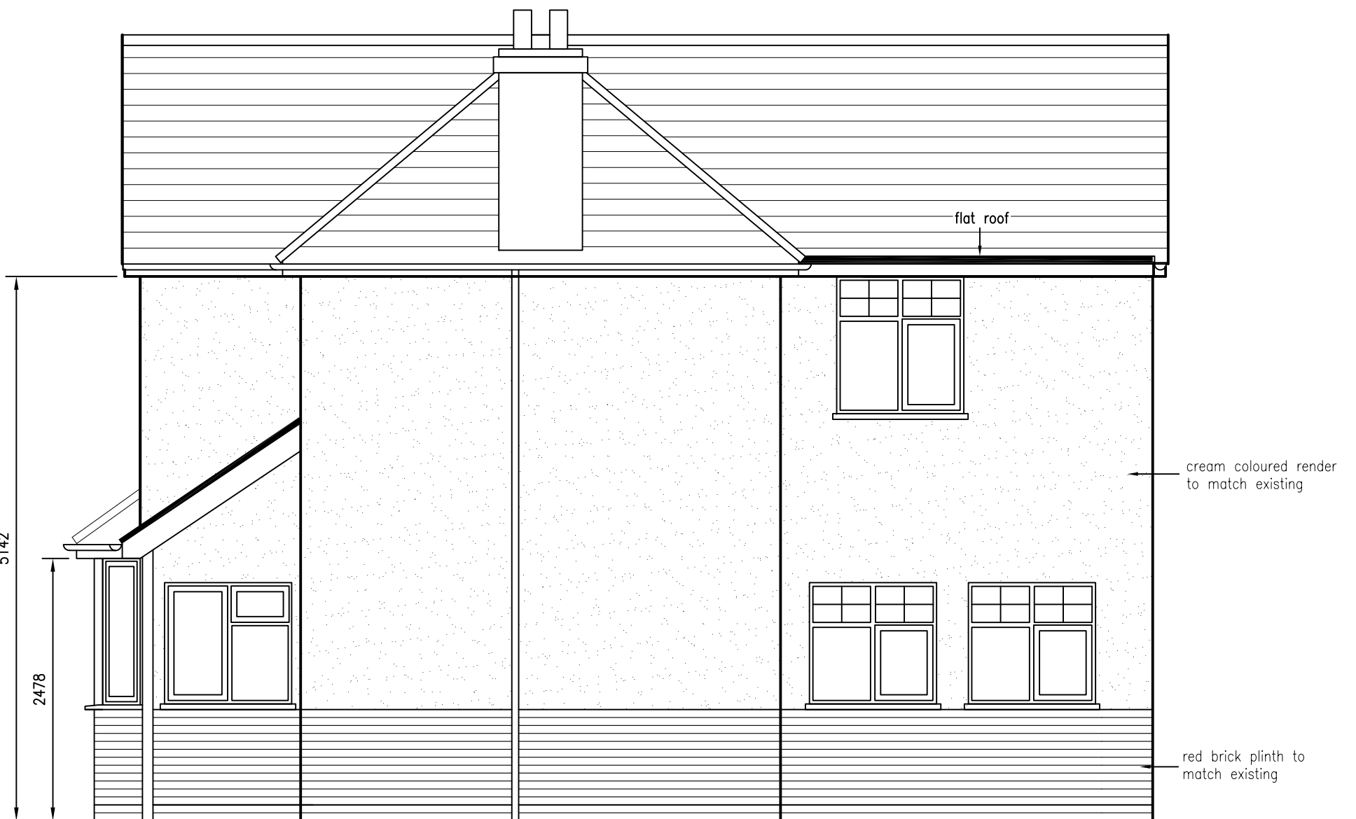
Proposed Side Elevation (SW) scale 1 : 50