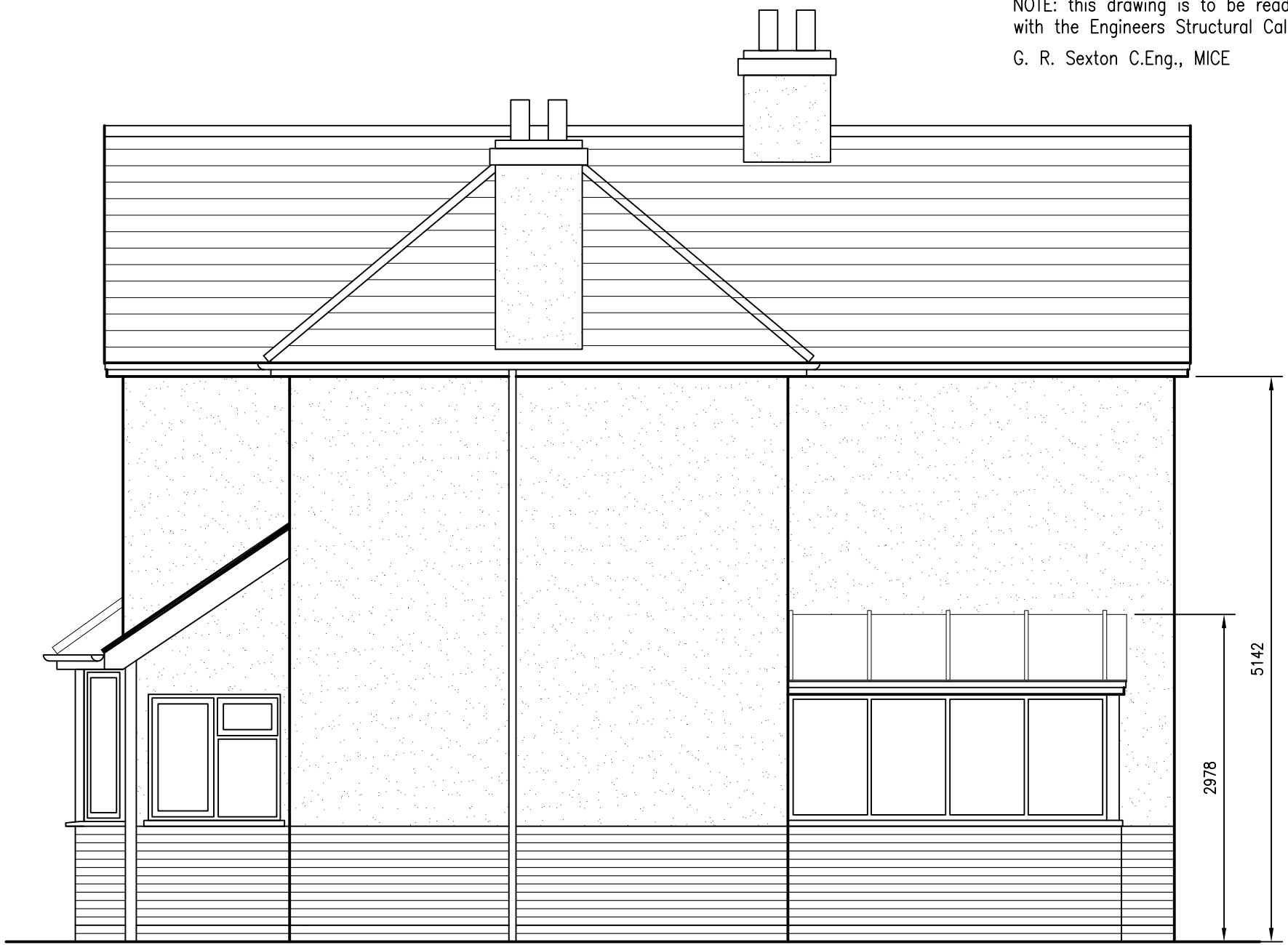
Existing Side Elevation (SW) scale 1 : 50

NOTE: this drawing is to be read in conjunction with the Engineers Structural Calculations G. R. Sexton C.Eng., MICE