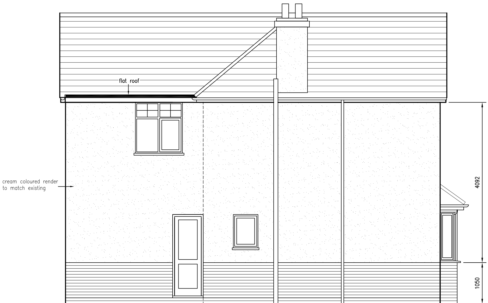
Proposed Side Elevation ( NE) scale 1 : 50 0 1 2 3 4 5

SEXTON DESIGN SERVICES BUILDING, CIVIL, & STRUCTURAL ENGINEERING SERVICES 21A Empress Avenue, West Mersea, CO5 8EX, tel & fax 01206 384153