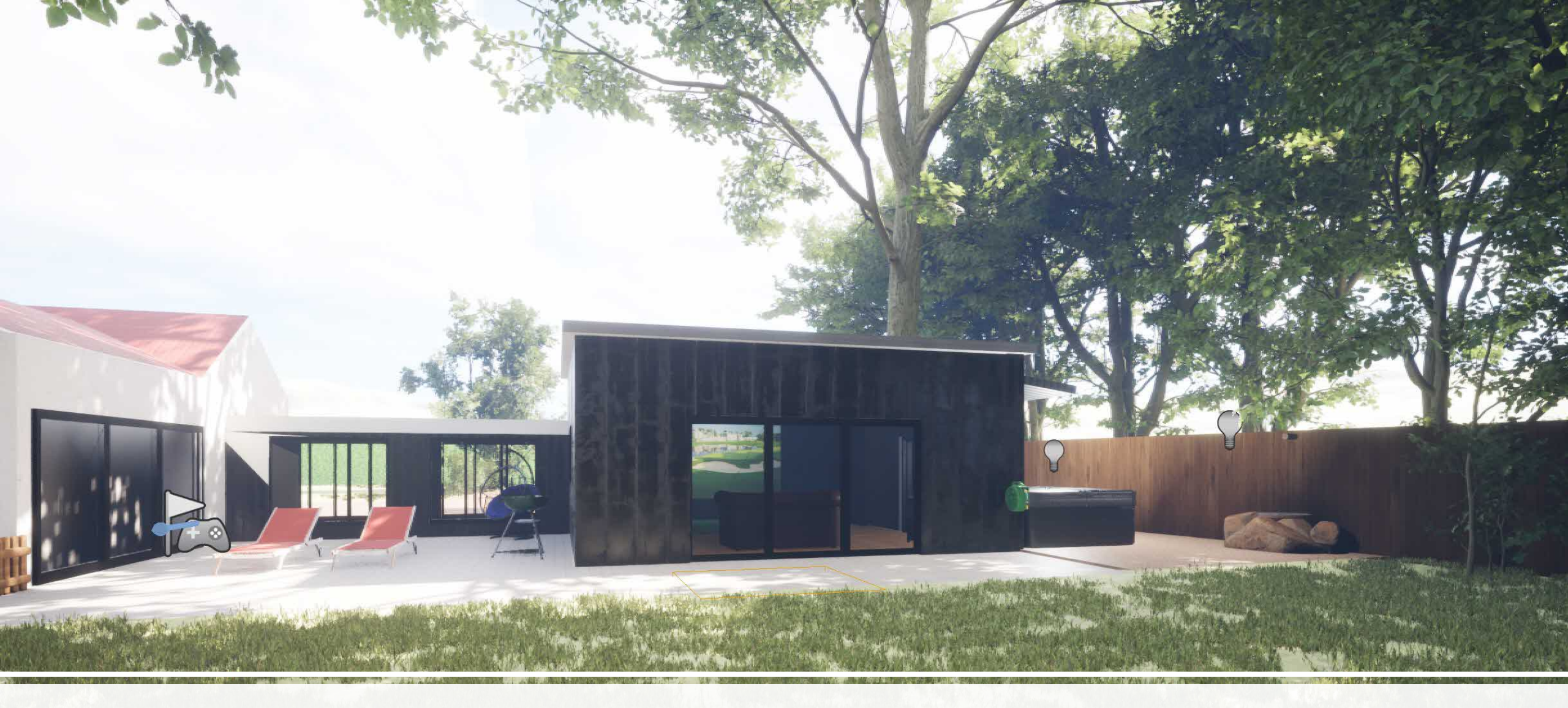
View from the garden – glazing facing back out to garden