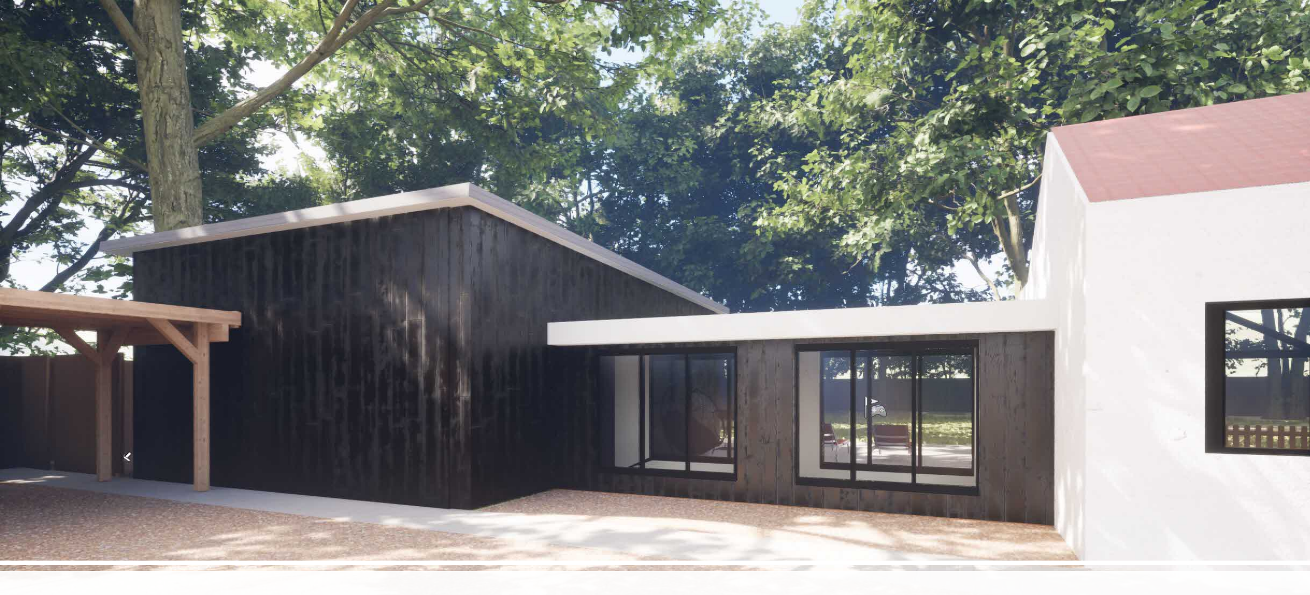
Up close to extension – dark wood clad glass hallway transparently connecting cottage