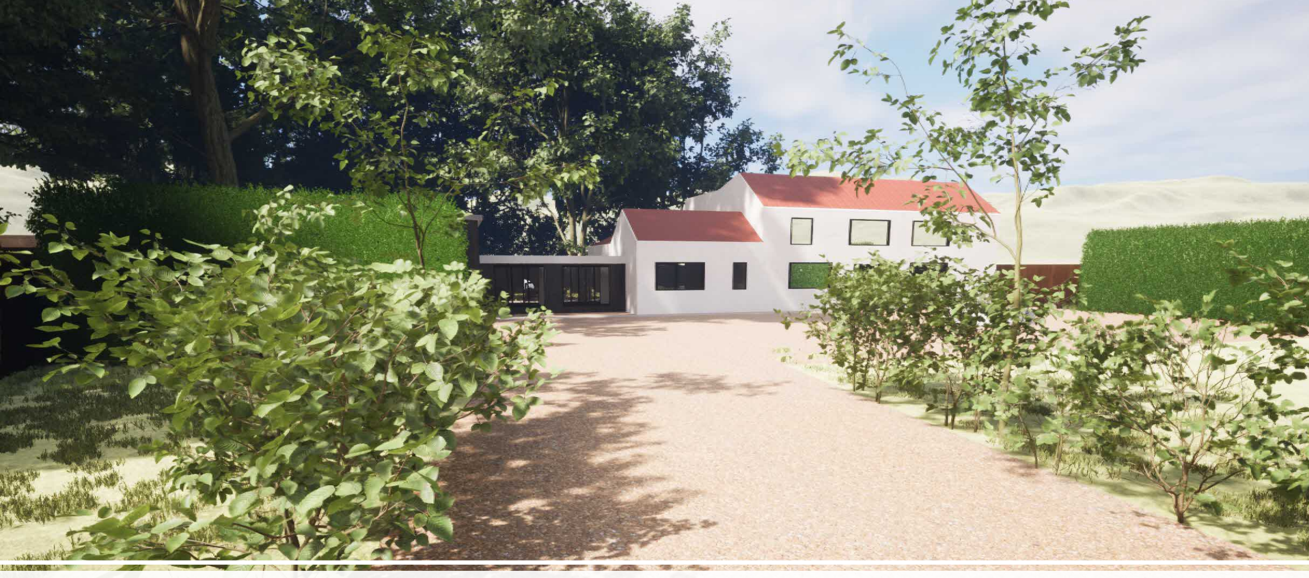
View from the road – both the approved and the proposed roof pitch to extension are not visible