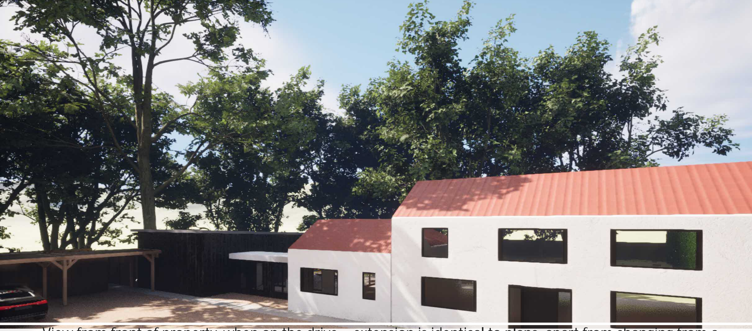
View from front of property, when on the drive – extension is identical to plans, apart from changing from a pitched to flat room. Height of roof is under peak height of approved drawings. Extension is clad in dark wood, blending in with the trees