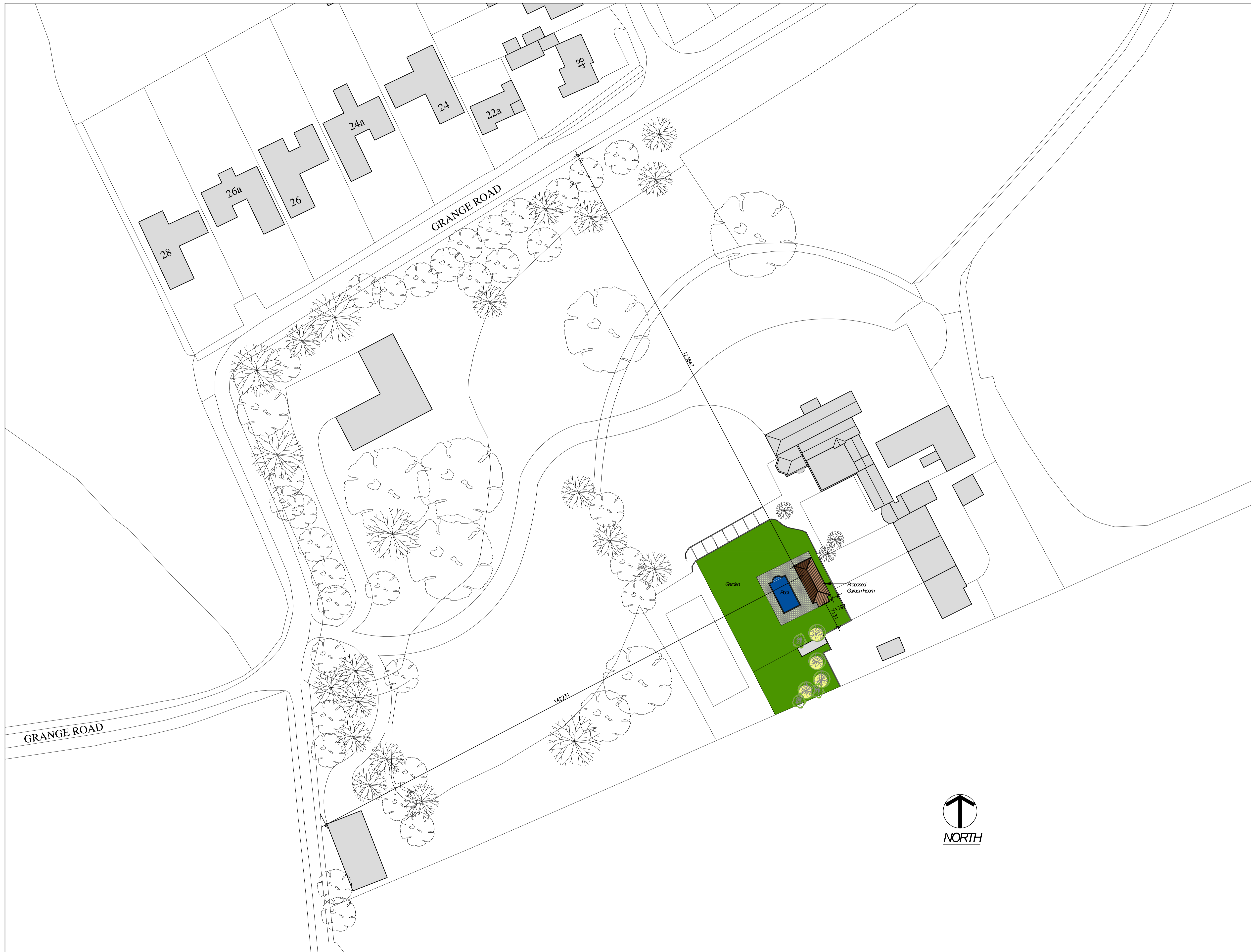
Proposed Site Plan Scale: 1:500