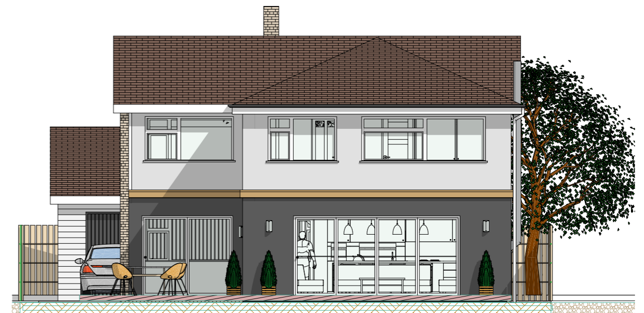
EAST REAR ELEVATION