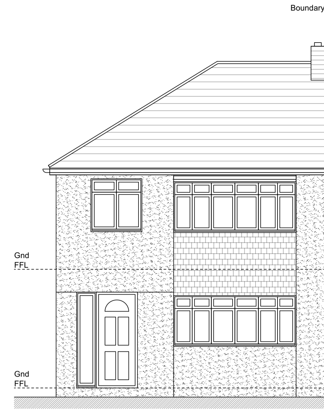
Front Elevation 0m 1m 2m 3m 4m 5m Scale bar