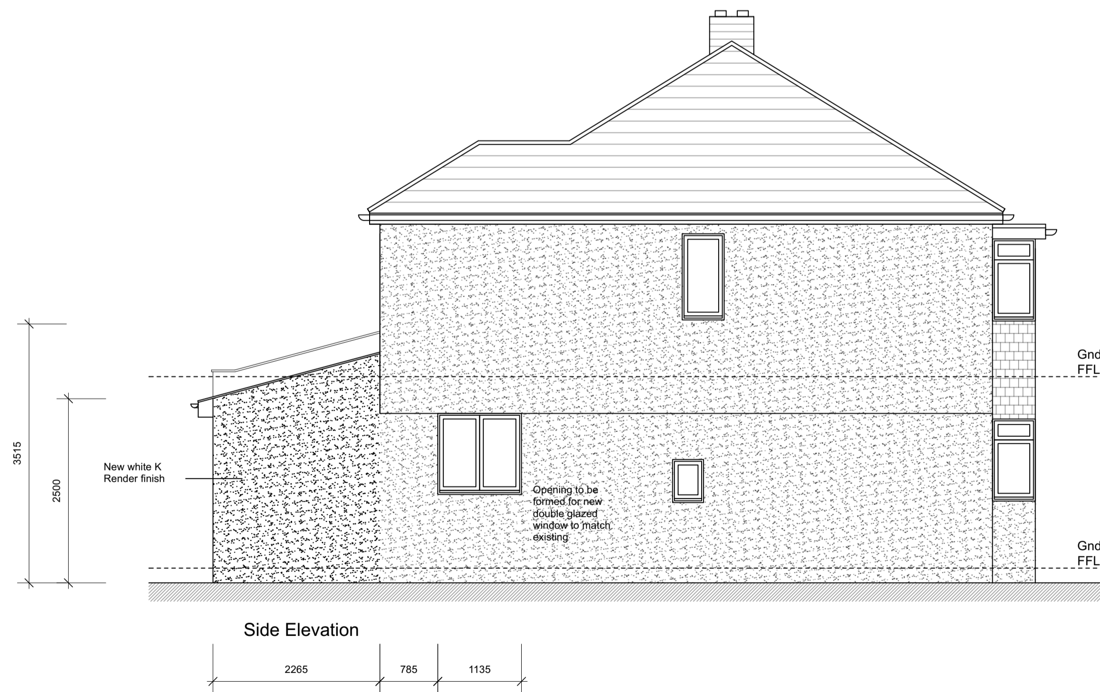
Side Elevation 2265 785 1135