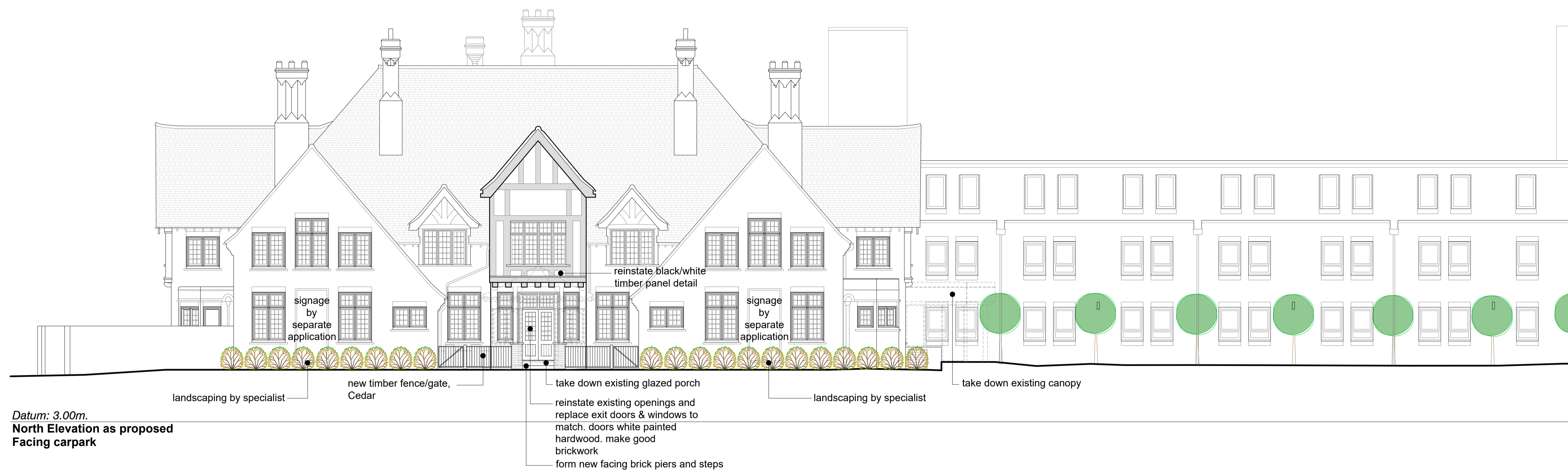
Datum: 3.00m. North Elevation as proposed Facing carpark