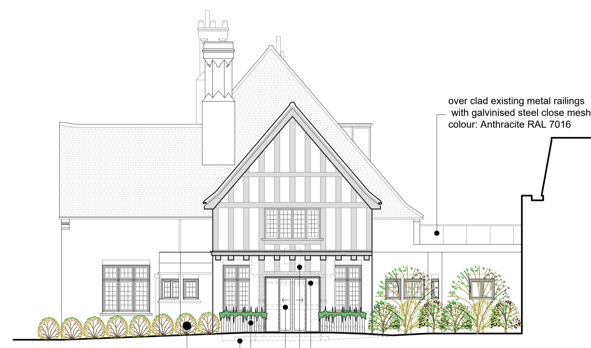
Datum: 10.00m. West Elevation as proposed Main Entrance

NOTE: ALL EXISTING WINDOWS AND TIMBER PANNELLING TO BE REPAINTED TO MATCH EXISTING