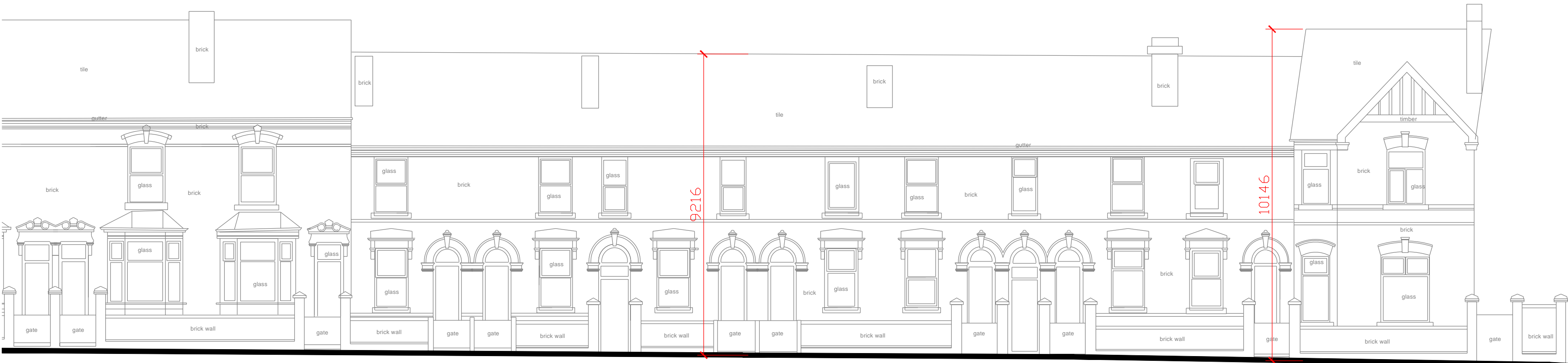
OPPOSING HOUSE ELEVATIONS DARTMOUTH STREET