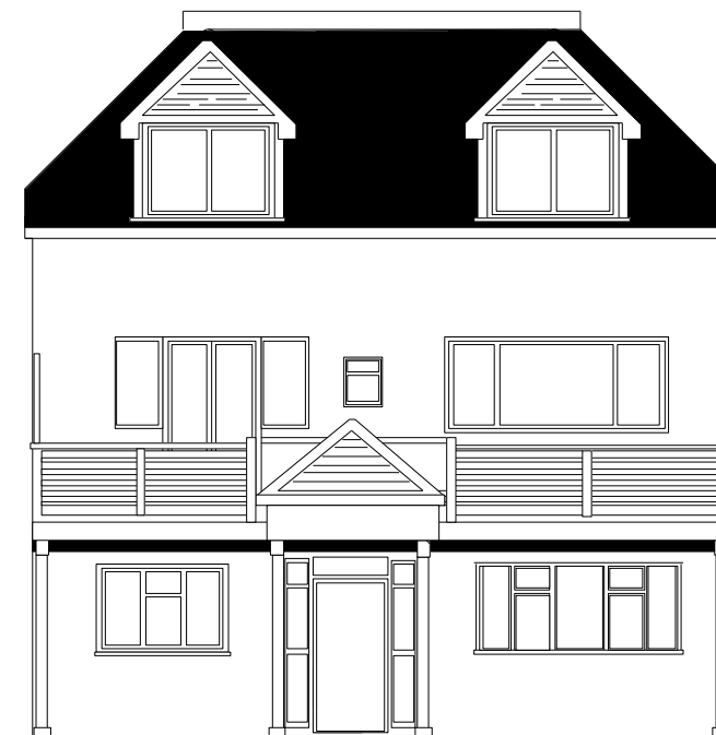
Proposed Balcony to Approved Frontage