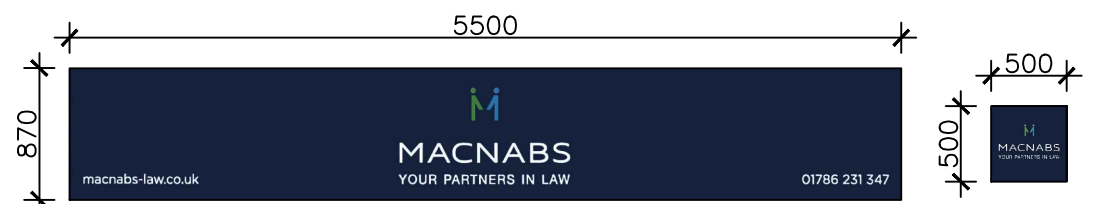
SIGN TO NORTH ELEVATION SCALE 1.50