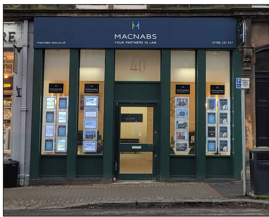
PHOTO OF SIGNAGE AND WINDOW DISPLAY