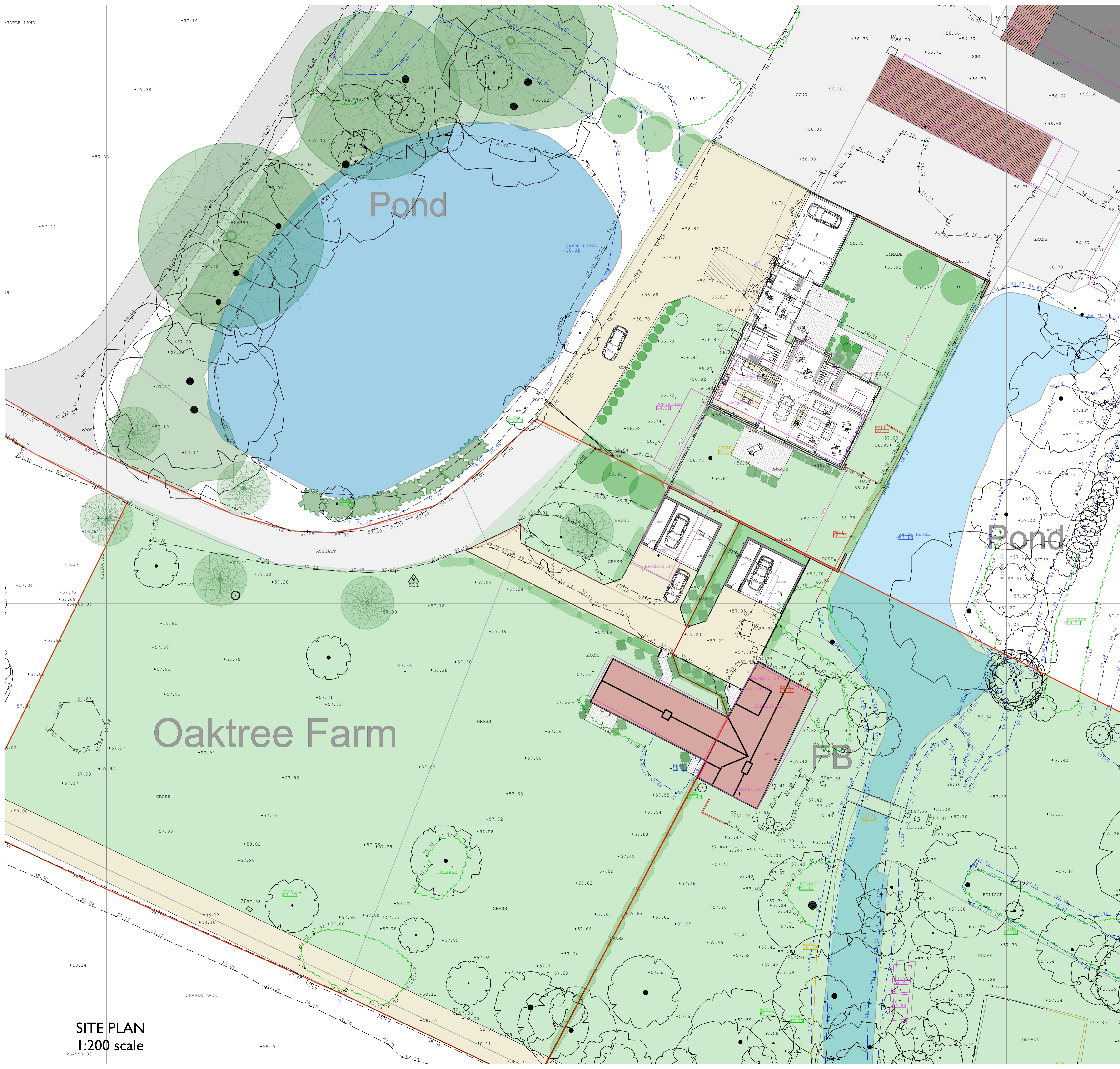
SITE PLAN 1:200 scale