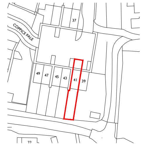
Site Location Plan (NTS) Ordnance Survey 100053143